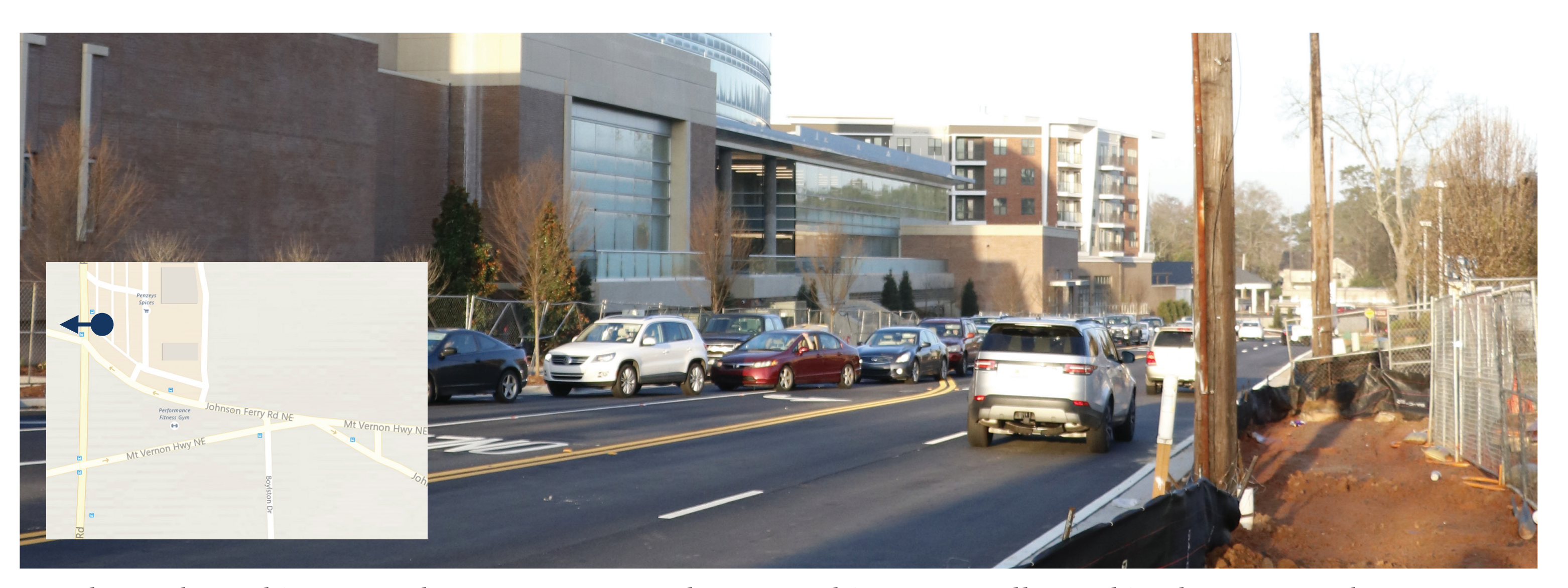
Eastbound stacking on Johnson Ferry Road approaching Roswell Road in the AM Peak