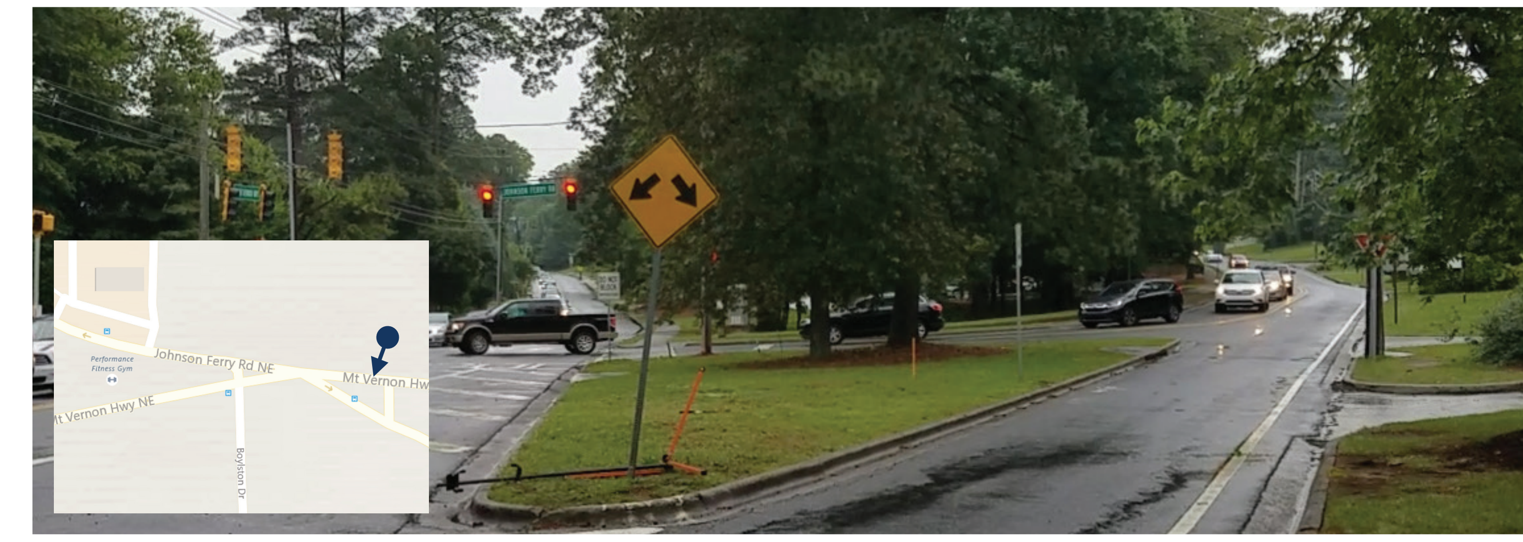
Westbound stacking on Mt Vernon Highway approaching Roswell Road through Johnson Ferry Road in the PM Peak