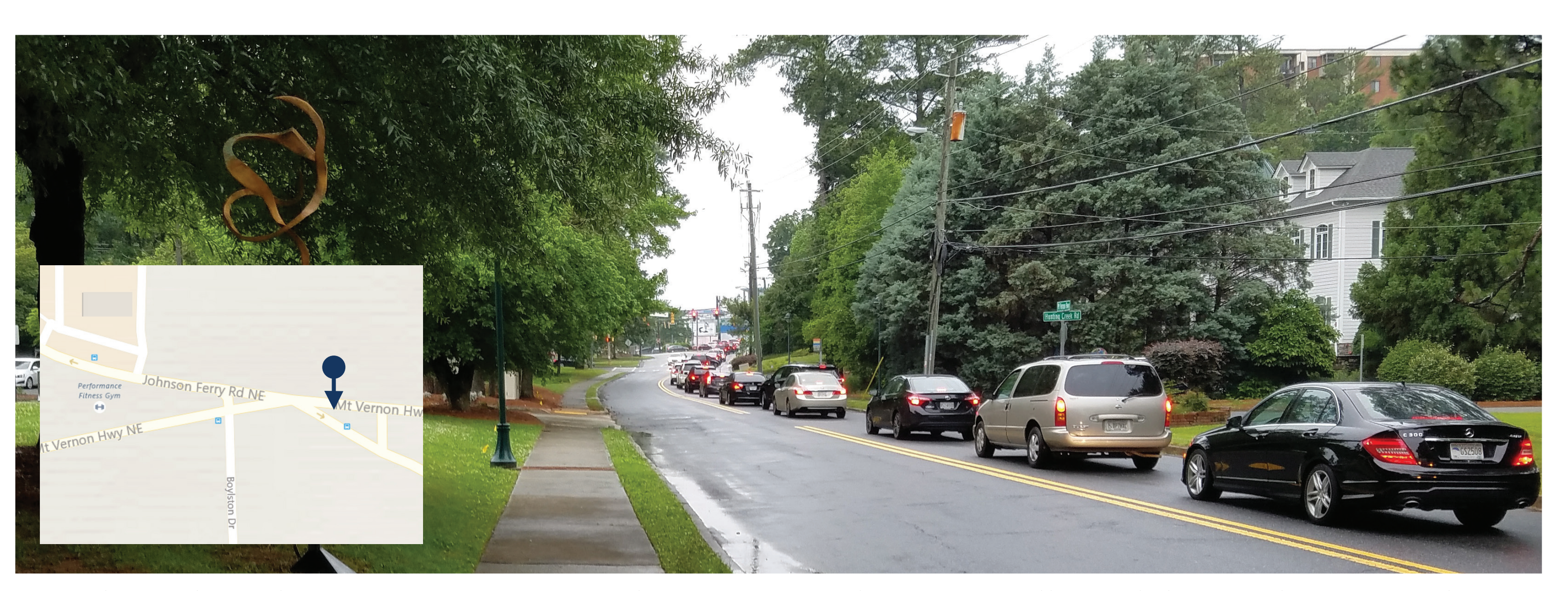
Westbound stacking on Mt Vernon Highway approaching Roswell Road during the PM Peak