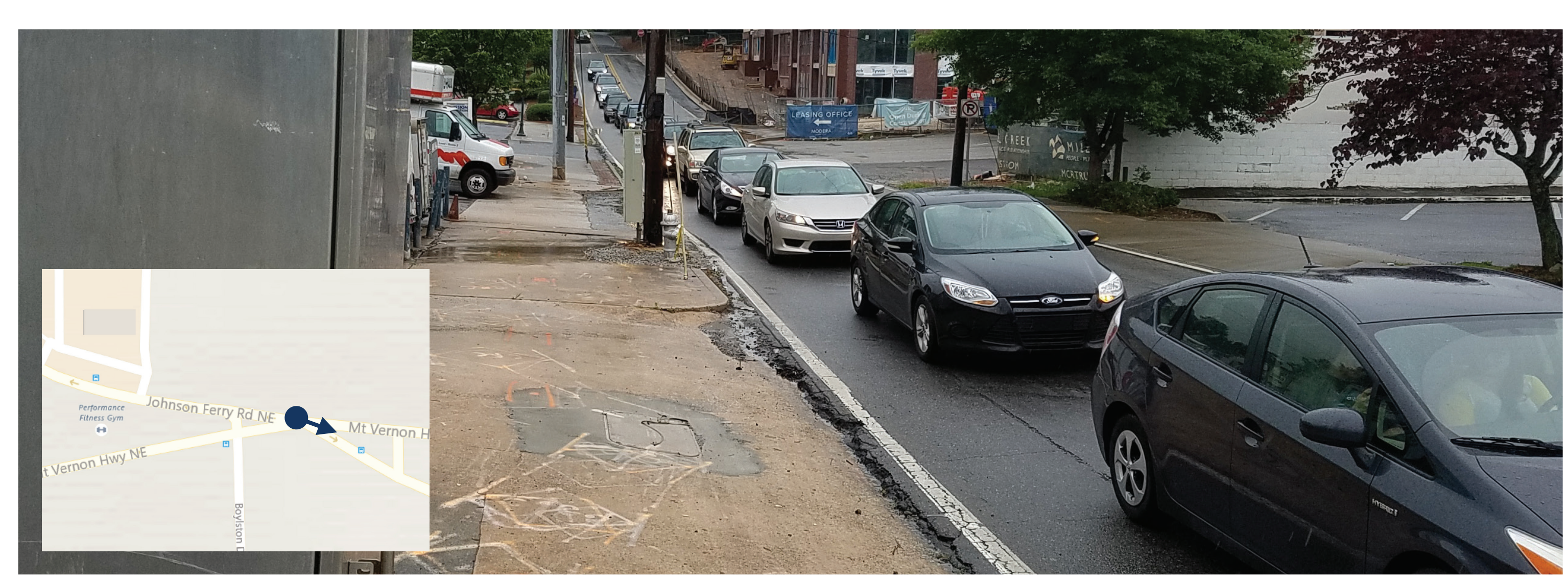
Westbound stacking on Hildebrand Drive approaching Roswell Road in the PM Peak