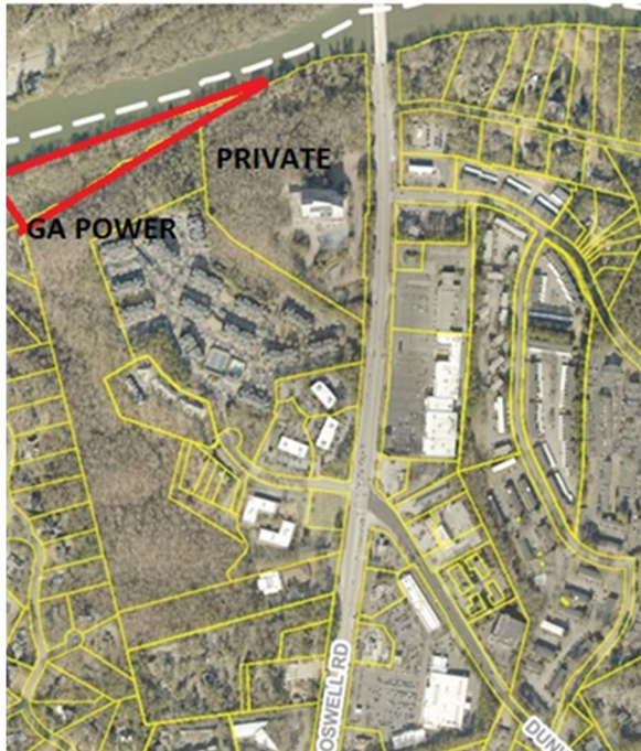
Property near 9040 Roswell Road

There are multiple opportunities to work with landowners in the area, including Georgia Power, which owns a parcel between the private property office building at 9040 Roswell Rd and the Huntcliff Preserve property at 9090 River Run. The company may be persuaded to donate the land for use as a trail or park.