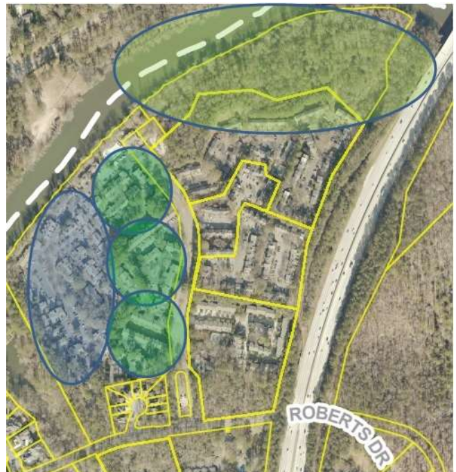
Properties West of GA 400

Another opportunity for connection to National Park property exists in the Morgan Falls area. The city's Comprehensive Plan talks about the need for better connectivity east and west in the Morgan Falls Area and discusses a trail that could connect Morgan Falls Park with Roswell Road—and, possibly, connect to future trails across Georgia 400 to Dunwoody.