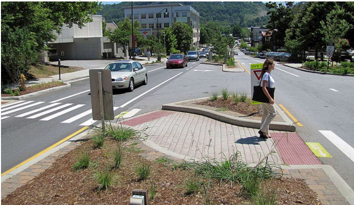
Pedestrian Safety Island