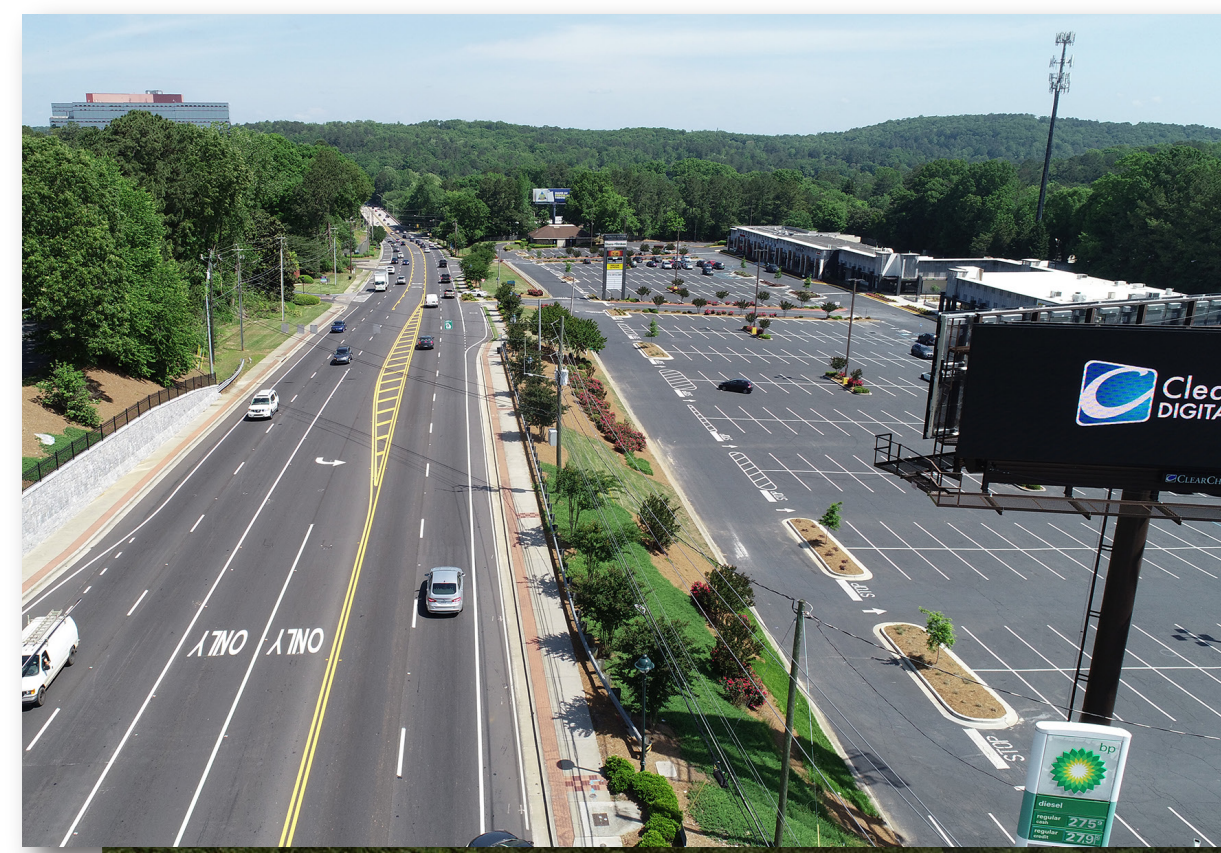
2 Proposed Sidepath at North River Shopping Center