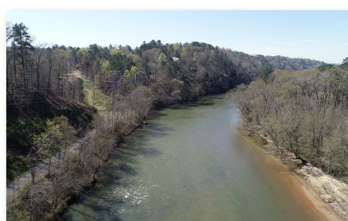
4 Proposed Trail Bridge over Chattahoochee River