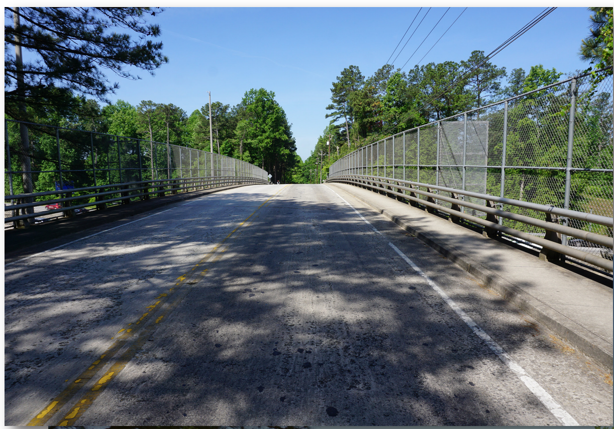
1 Proposed Sidepath at Roberts Drive Bridge