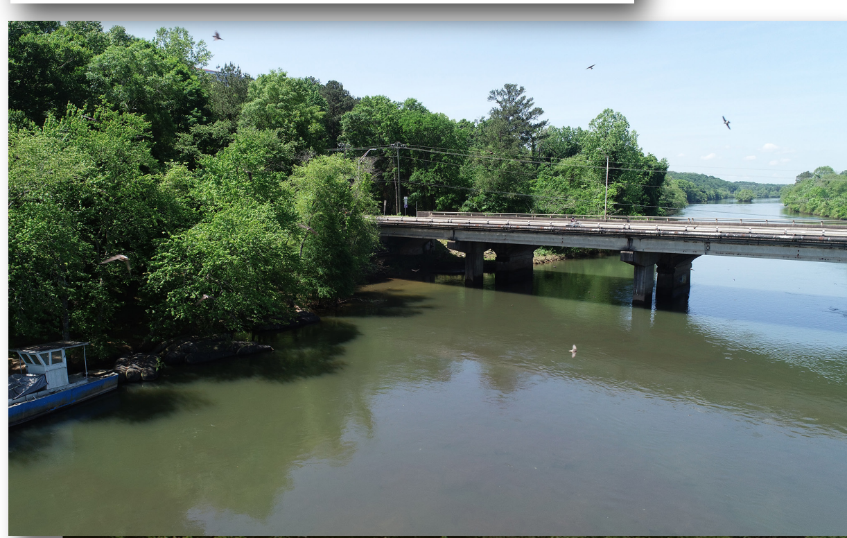
3 Proposed Trail under Roswell Road / Future Pedestrian Bridge