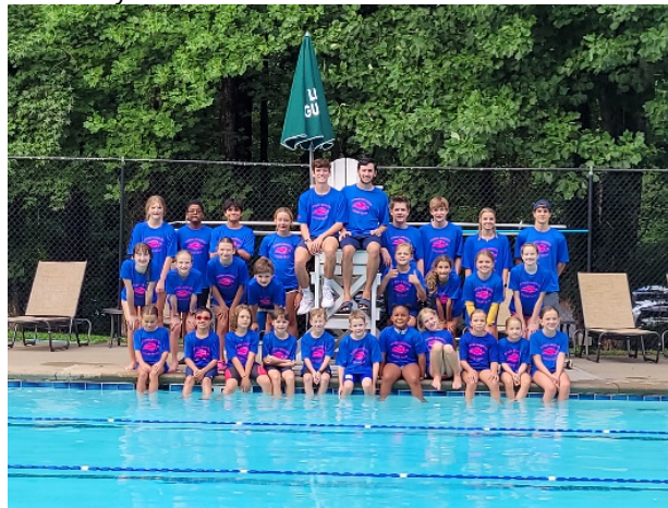
Sandy Springs Swim Team