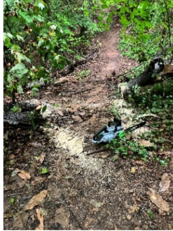
Ridgeview Park – Tree cleared of trail