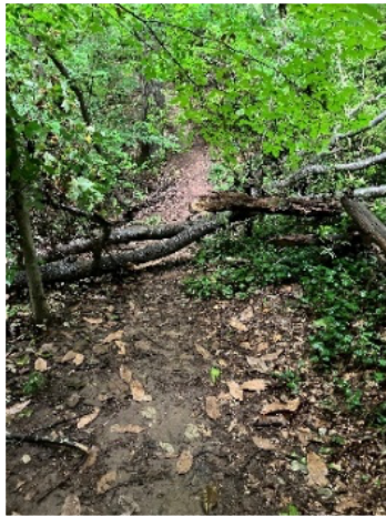
Ridgeview Park – Tree blocking trail