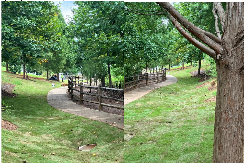
Overlook Park – Landscaping Project