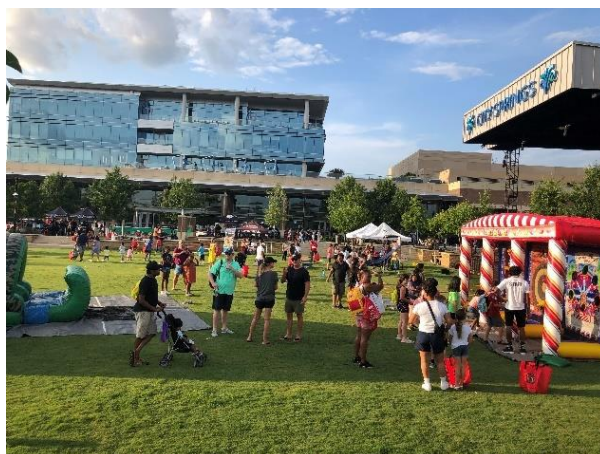
Back to School Bash