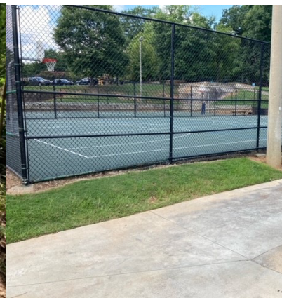
Hammond Park Fencing