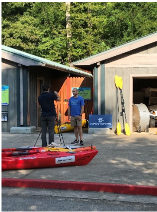
WSB Interview -Kayak Program