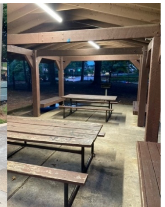
Hammond Park Small Pavilion