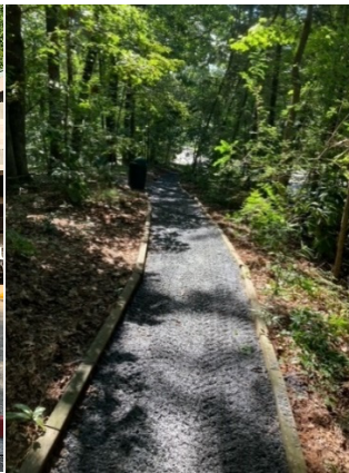
Spalding Park Trail