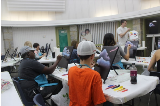
Paint Like Bob Ross