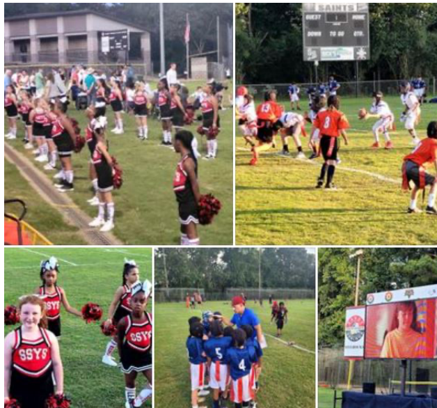
SSYS Football and Cheerleading