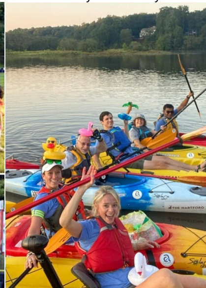
Adaptive Kayaking Group