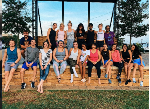
Flexibility Class – City Green