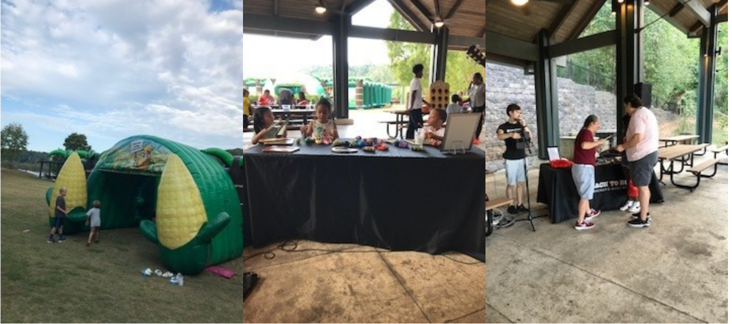
Fall Fun For All