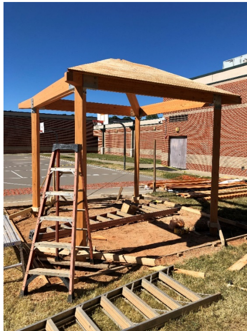
Sandy Springs Charter Middle School Small Pavilion Installation