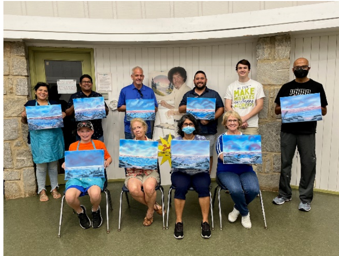
Paint Like Bob Ross