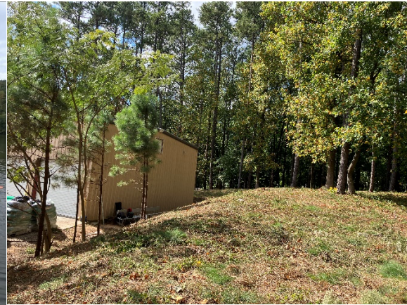
Hammond Park Maintenance Shed