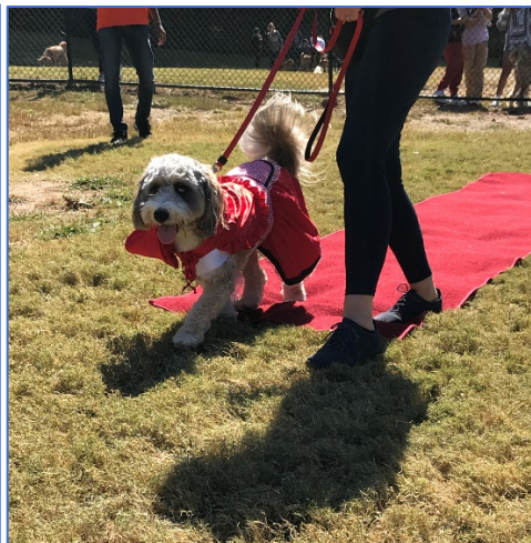
Medium Dog Winner – Motek