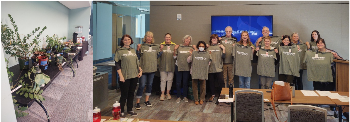
Invasive Plant Management Workshop