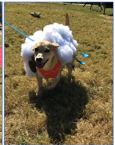
Best in Show - Kyle