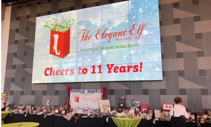
The Elegant Elf in the Studio Theatre Lobby