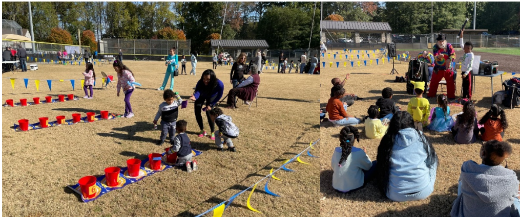
Kids Day in the Park 2022