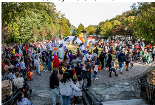
Spooky Springs 2022