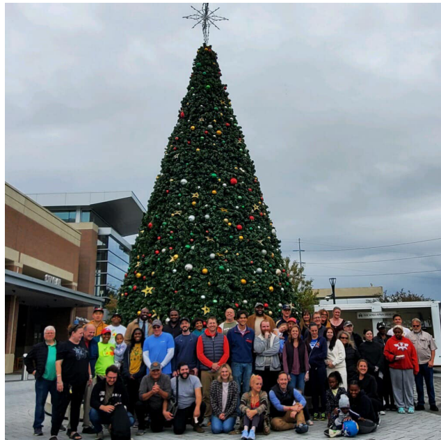
Sandy Springs Farmers Market Group Photo