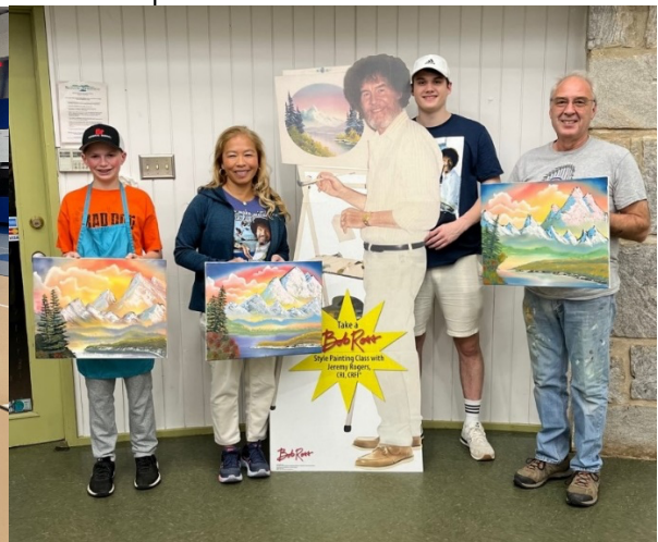
Paint Like Bob Ross!