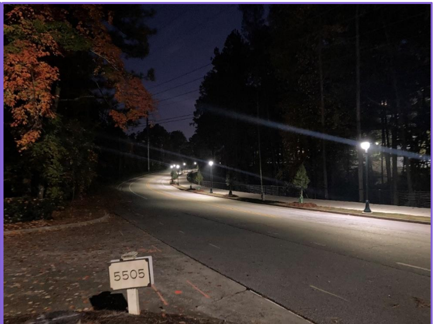
Completed Interstate North Parkway Sidepath with Final Landscaping Installed