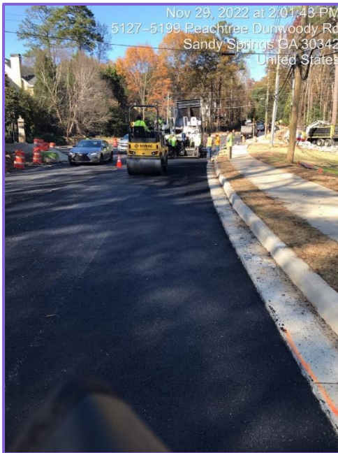
Roadway leveling underway Peachtree Dunwoody Road at Telford