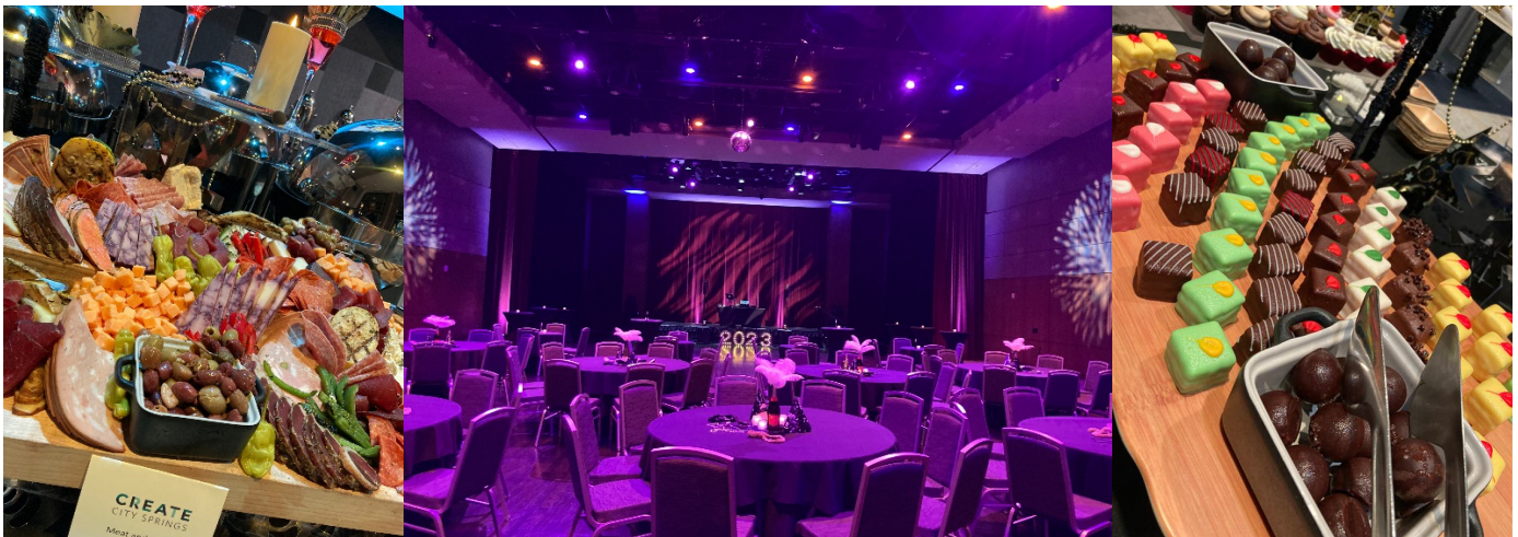
New Year's Eve Event in Studio Theatre