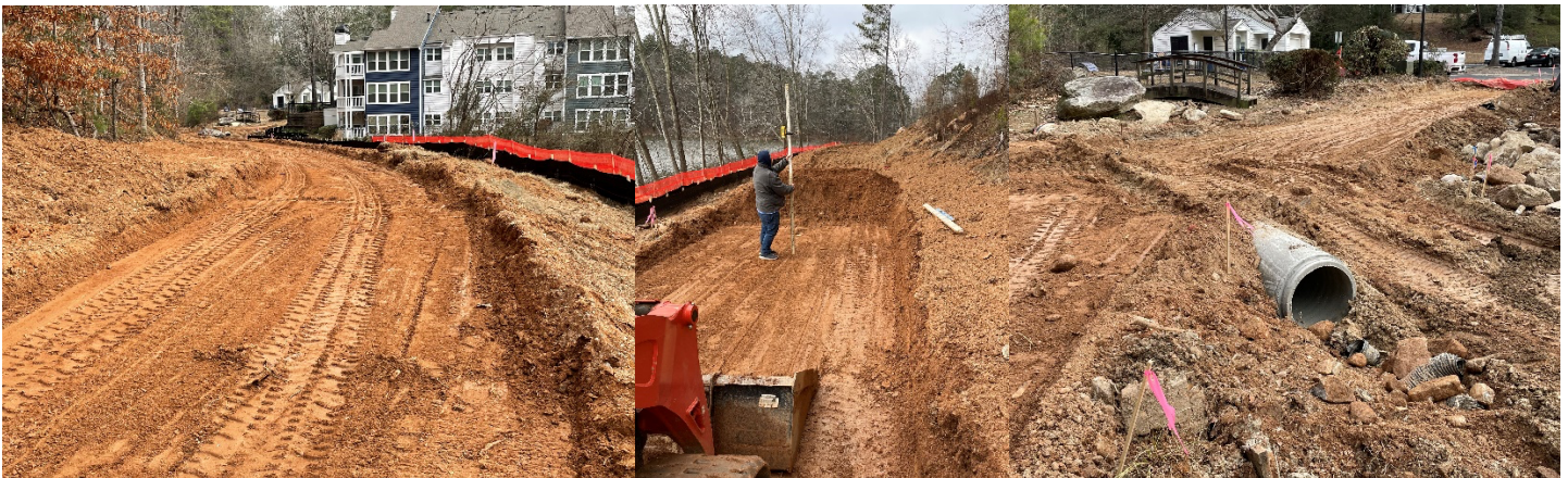
Progress at Trail 2A