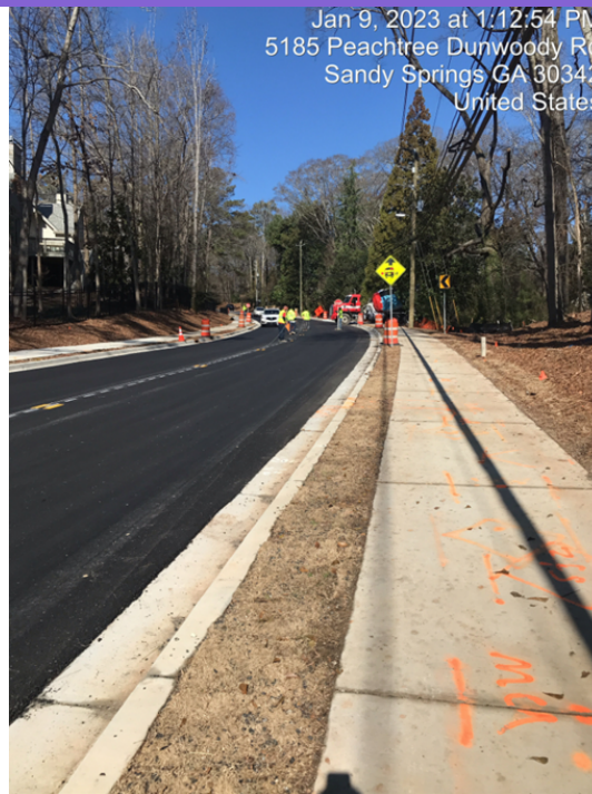
T64 – Peachtree Dunwoody Road Final Paving