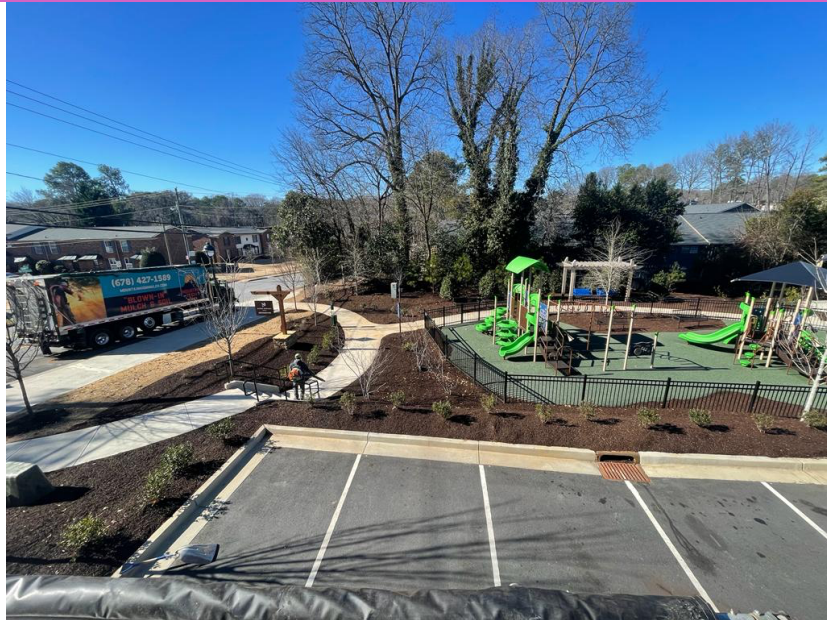
Mulched Areas of Northwood Park