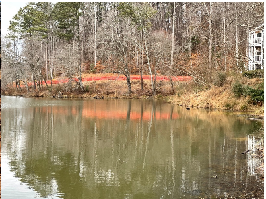
Trail 2A Spur from Pier