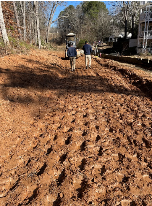
Trail 2A Compaction