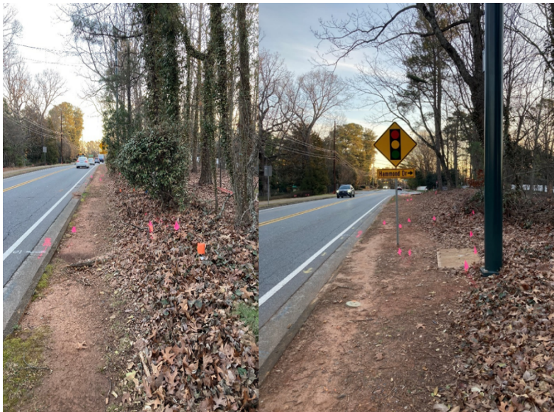
S2170 Mt. Vernon Sidewalk Survey Work and Utility Locate Flagging