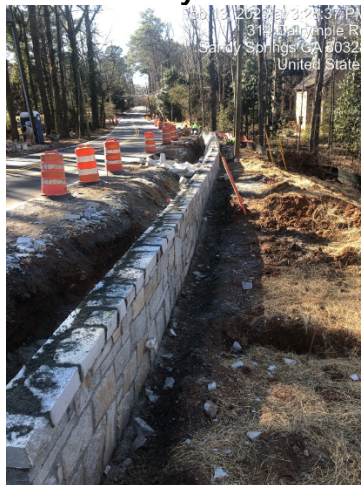
TS168 Dalrymple Sidewalk Wall