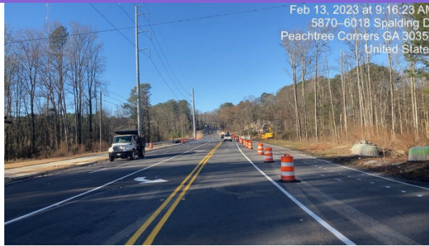
TS166 Spalding Sidewalk and Roadway Widening-additional Lane opened