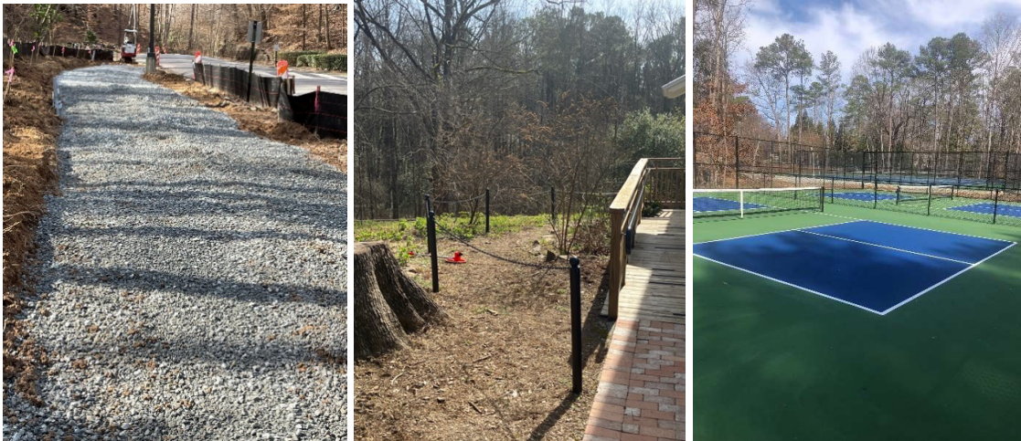
(Left to Right) – Trail 2A, Lost Corner Preserve, Ridgeview Charter Middle School Tennis Courts