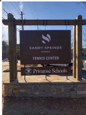
The Sandy Springs Tennis Center monument sign