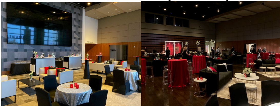
A Mitzvah in the Studio Theatre and Studio Theatre Lobby