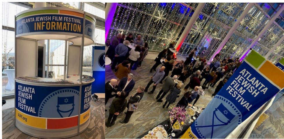
Atlanta Jewish Film Festival in the Byers Theatre Lobby