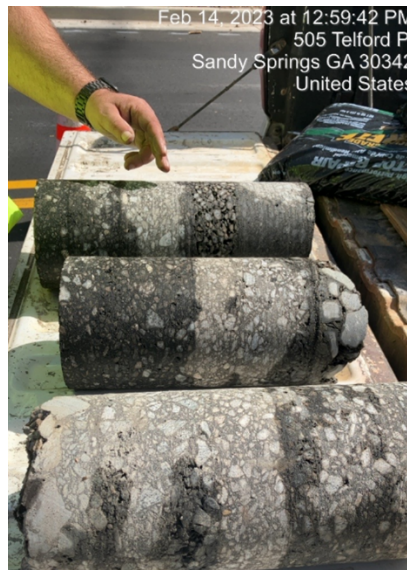
T0064 Asphalt inspection and testing