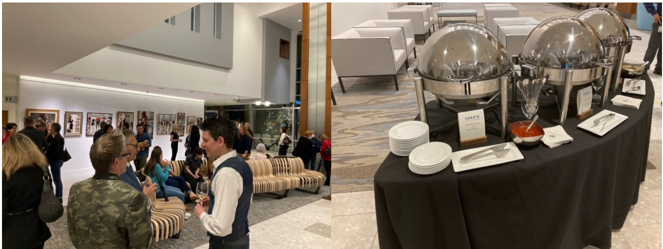
Lorraine Christie Art Exhibit