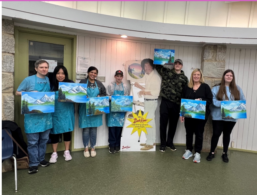
Paint Like Bob Ross