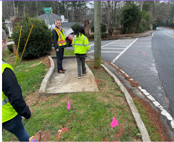
S2184 Jett Ferry Spalding Sidewalk Design Site Review