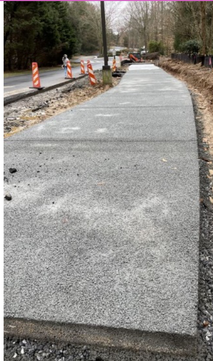
Trail 2A Pervious Progress