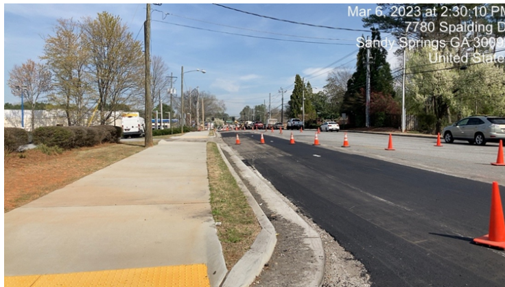
TS-166 Spalding Widening – Roadway milling and preparation for final paving.