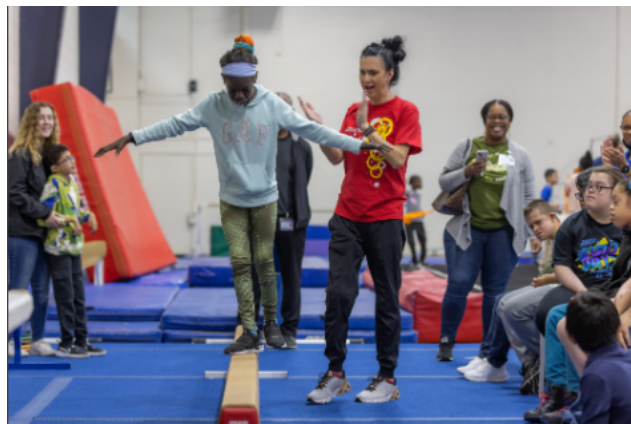
Fulton County Special Olympics Gymnastics at Hammond Park Recreation Center