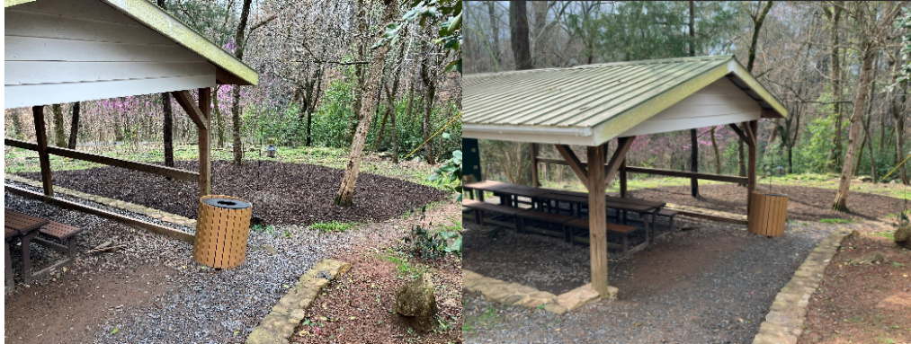
Lost Corner Preserve Maintenance/Landscaping