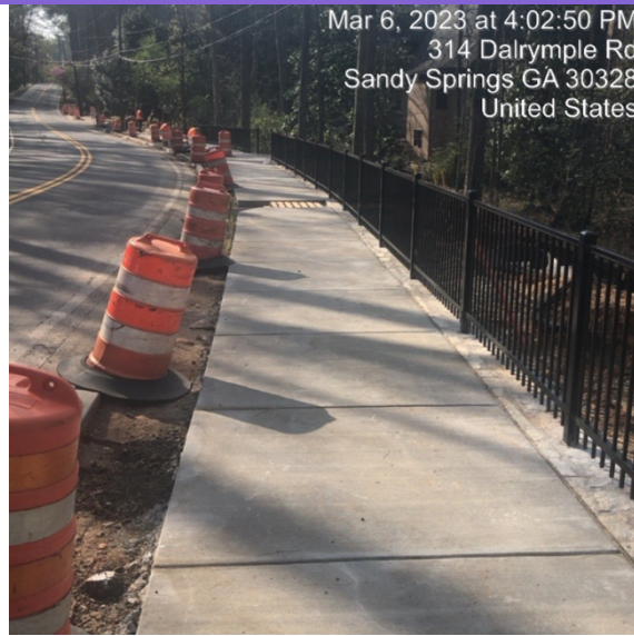
TS-168 Dalrymple wall with handrail and final sidewalk nearing completion.