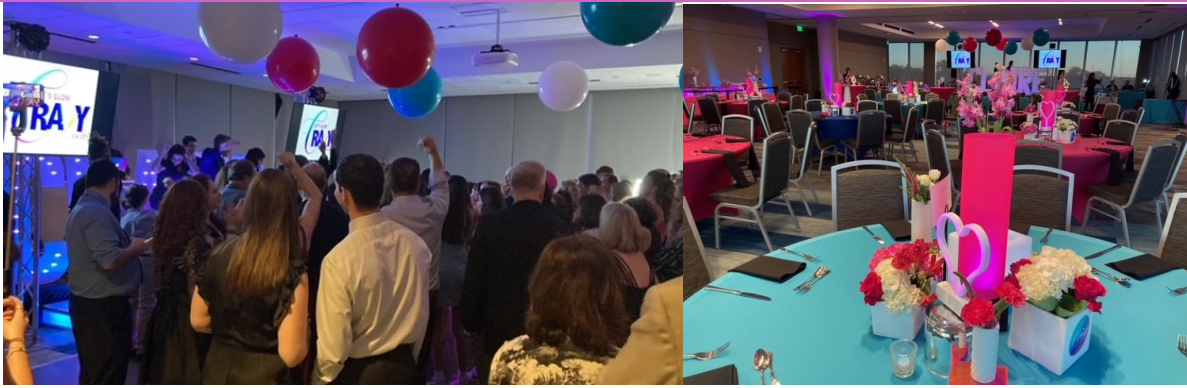
Mitzvah Ceremony and Celebration in the Terrace Meeting Room