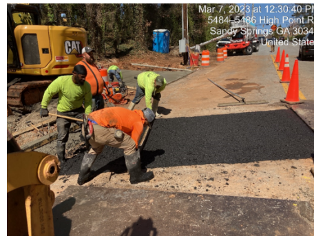
5490 High Point Road Stormwater Repairs