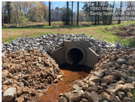
7560 Winters Chapel Road Stormwater Repairs