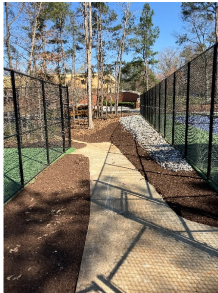
Ridgeview Park mulched areas