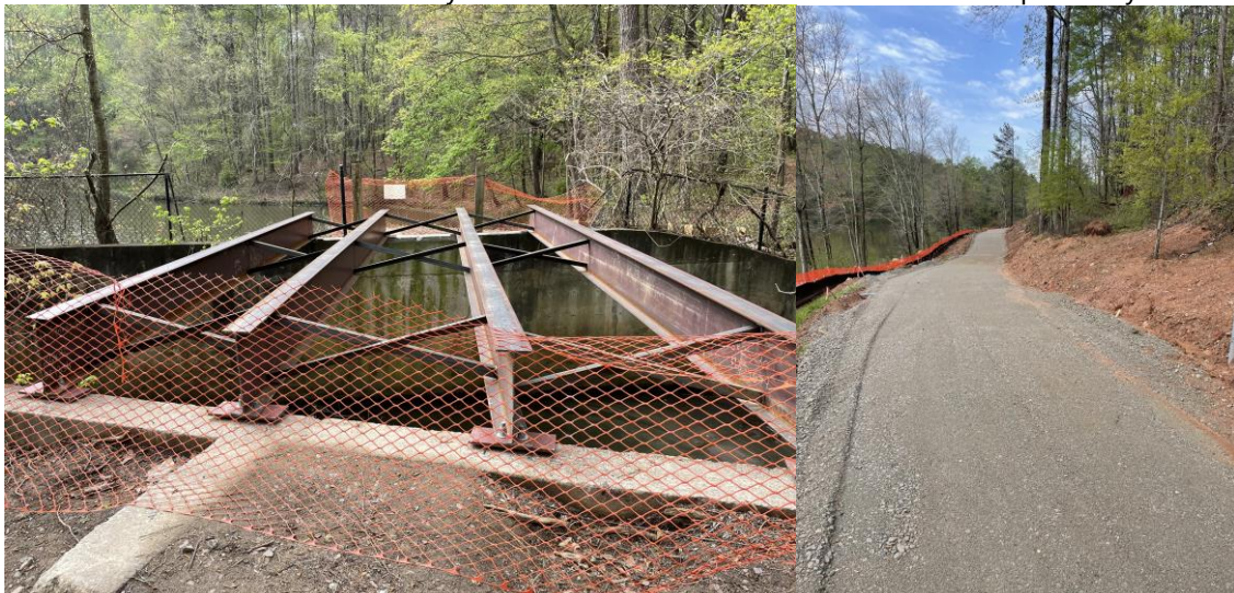
Trail 2A (left to right) – Welded bracing to bridge at spillway, Compaction testing at Spur Trail