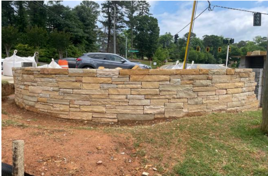
Stone Cladding Installed on Pedestrian Landing Walls at Johnson Ferry Road and Abernathy Road