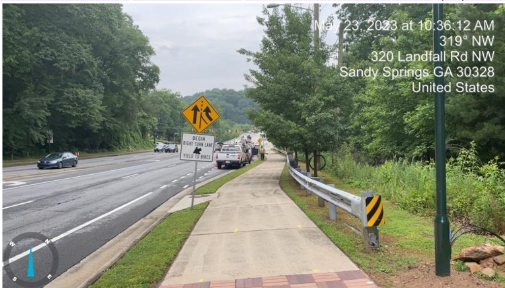
Johnson Ferry Road Pedestrian Lighting