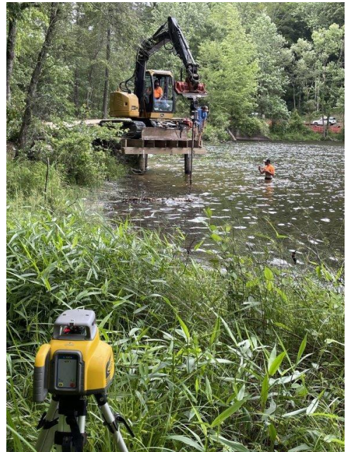
Morgan Falls Connector Phase 2A- Edgewater Page 1