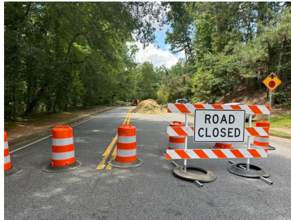
TS106 Northside/Old Powers Ferry/Riverview Intersection site work