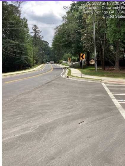
T0064 Peachtree Dunwoody-Telford Final Striping completed.