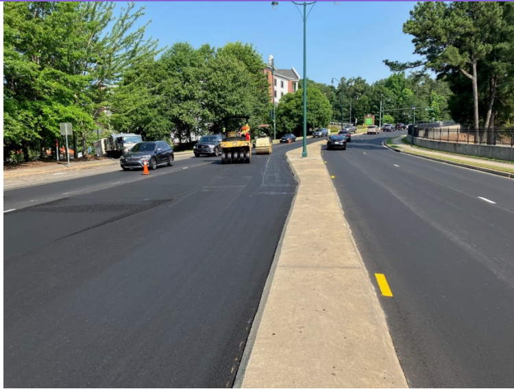
FY23 Resurfacing Peachtree Dunwoody Road