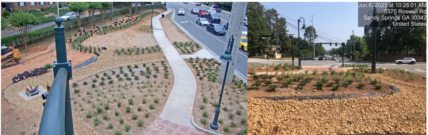
T43 Roswell Road at Glenridge Landscaping