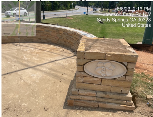
T4000 Johnson Ferry Hardscapes