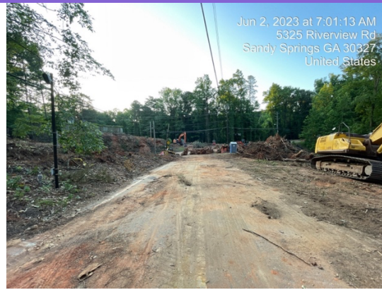
TS106 Northside/Old Powers Ferry/Riverview Intersection site work