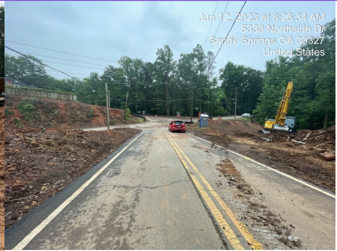
TS106 Northside/Old Powers Ferry/Riverview Intersection site work