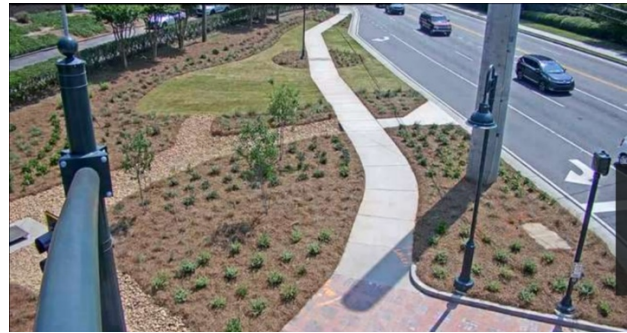
T43 Roswell Road at Glenridge Landscaping