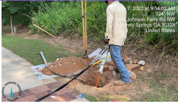
T2307 Johnson Ferry Light Pole Installation Work