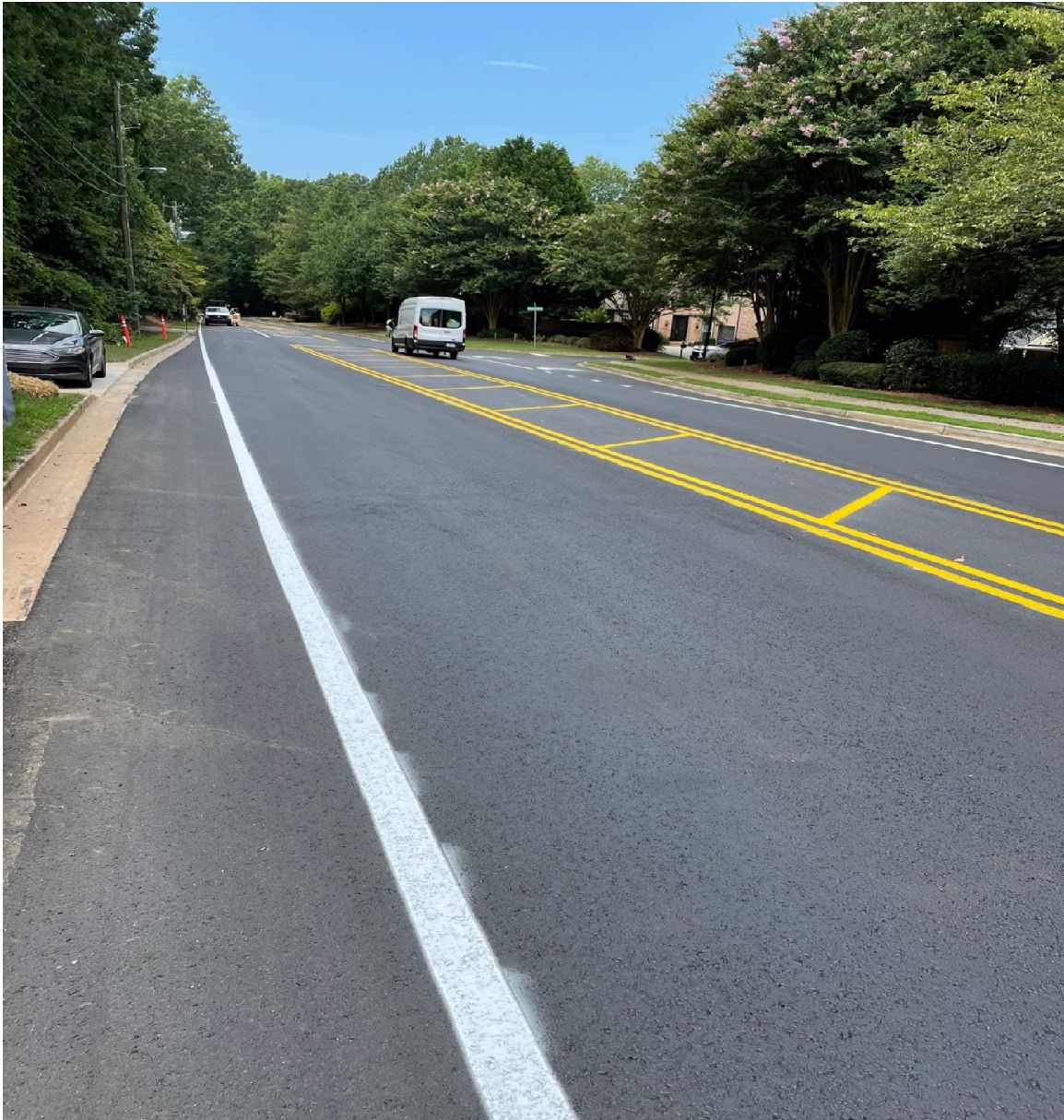
Sewer Tie-in and Paving Complete