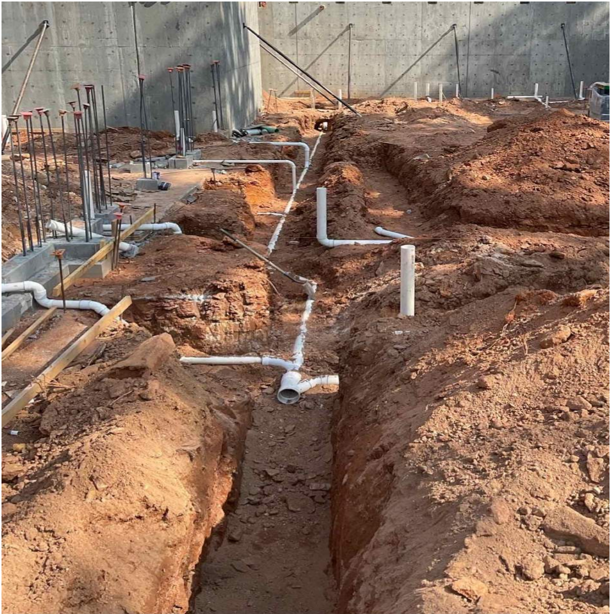
MEP Underslab Rough-in