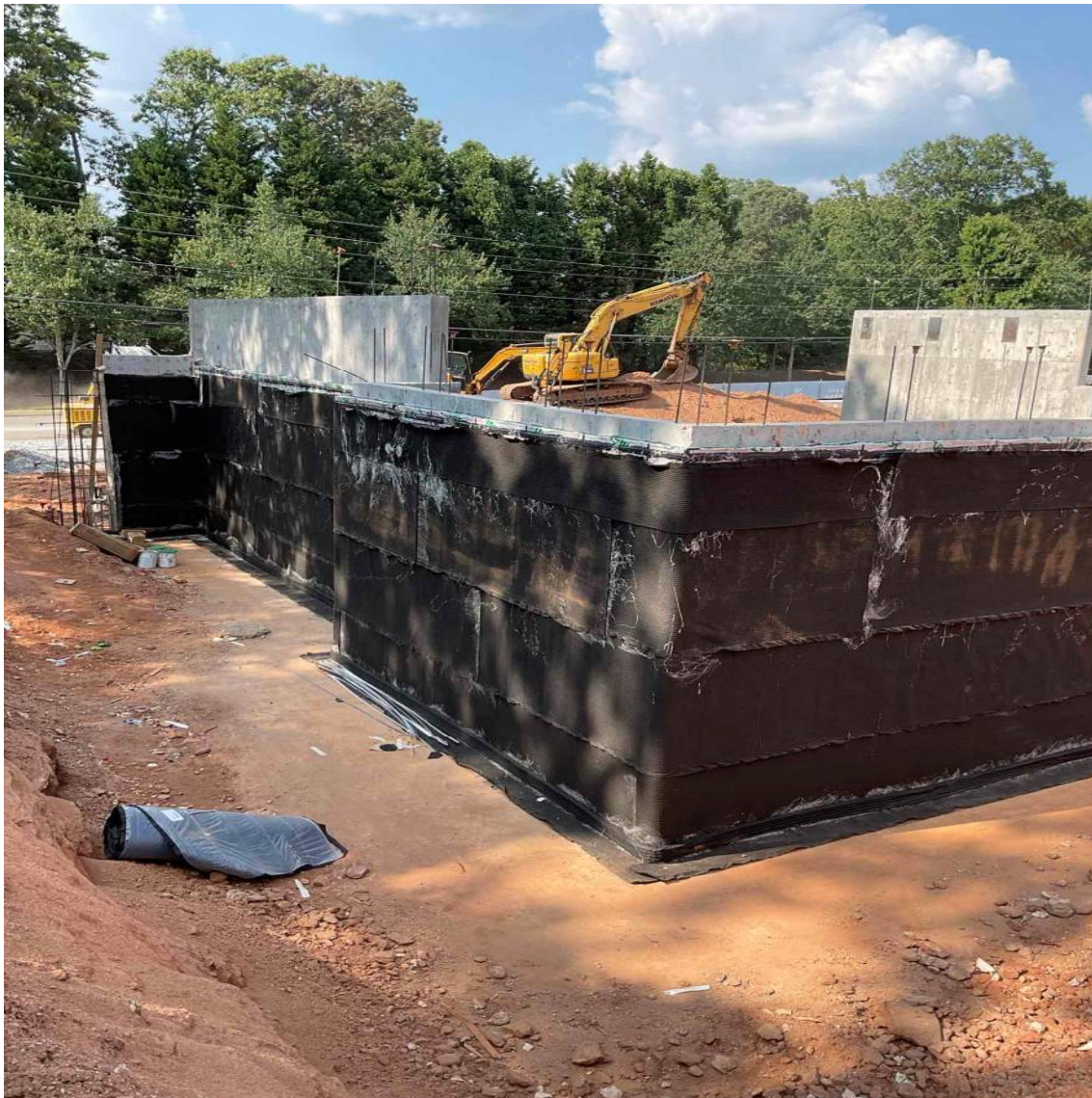
Foundation Wall Waterproofing