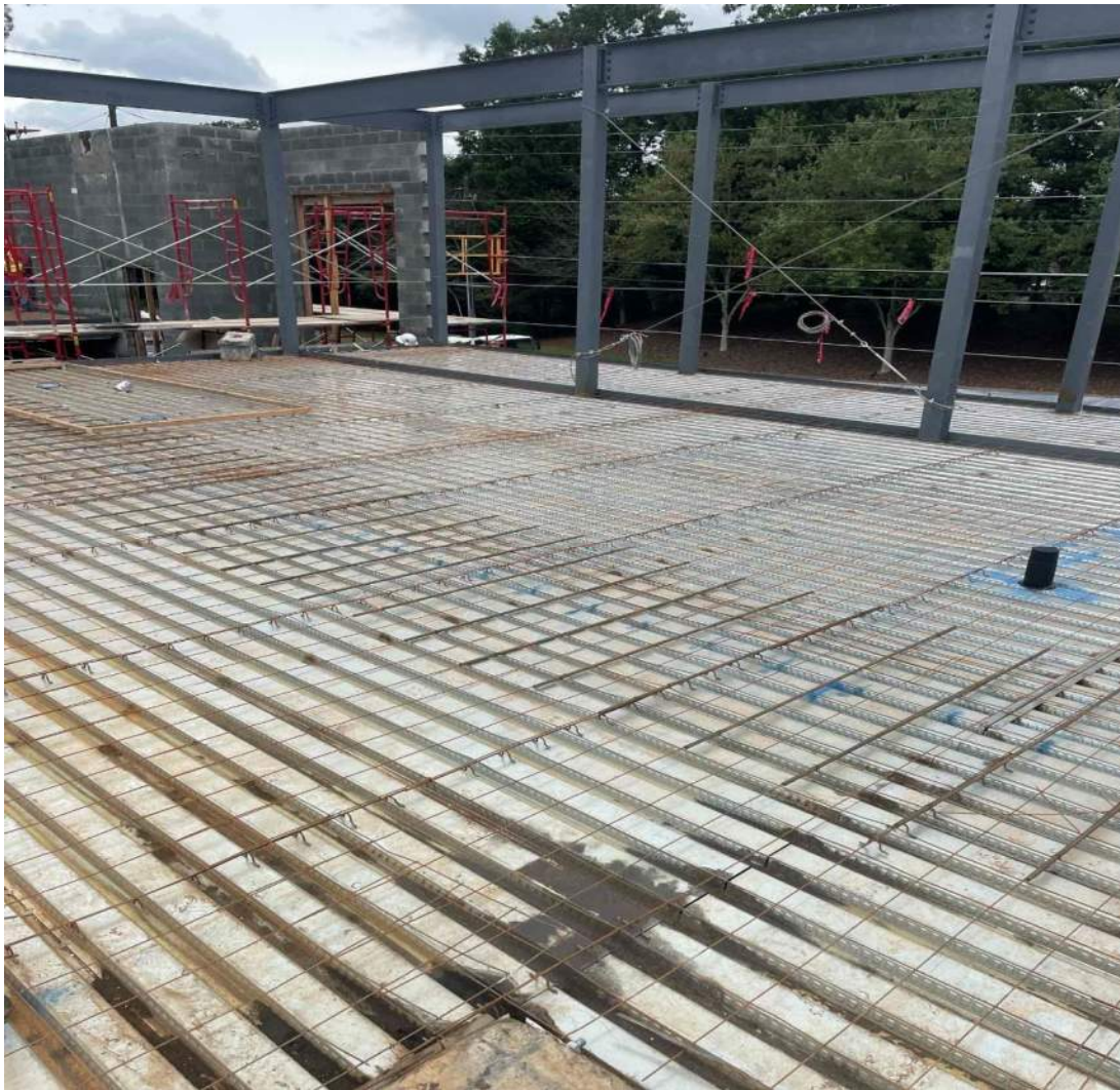
Elevated Slab on Deck Prep at the Second Floor