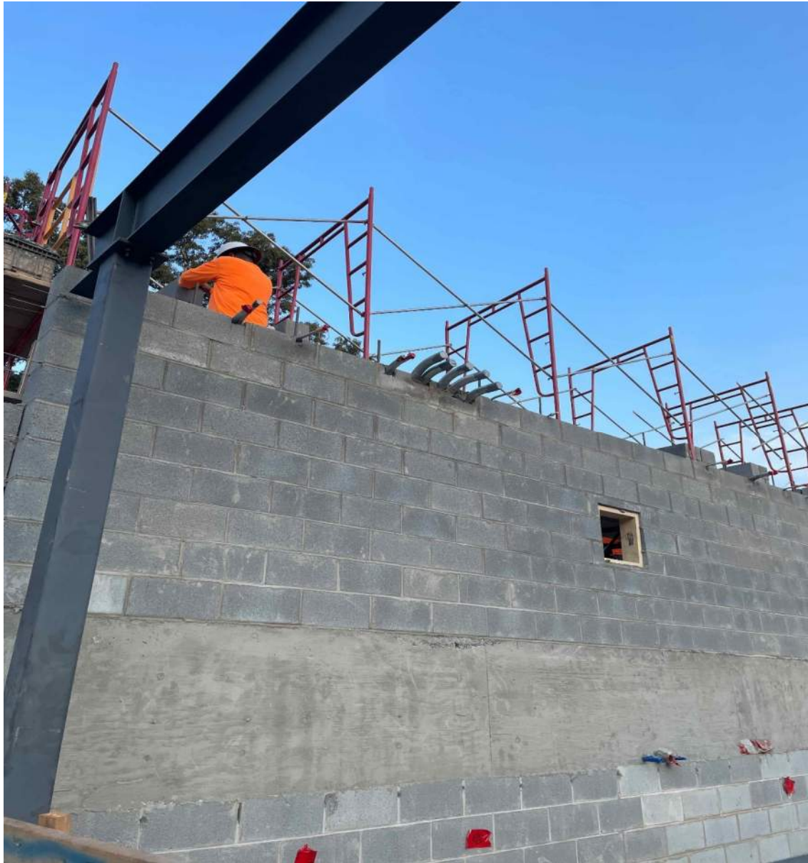
Continuing in-wall Rough-in and CMU