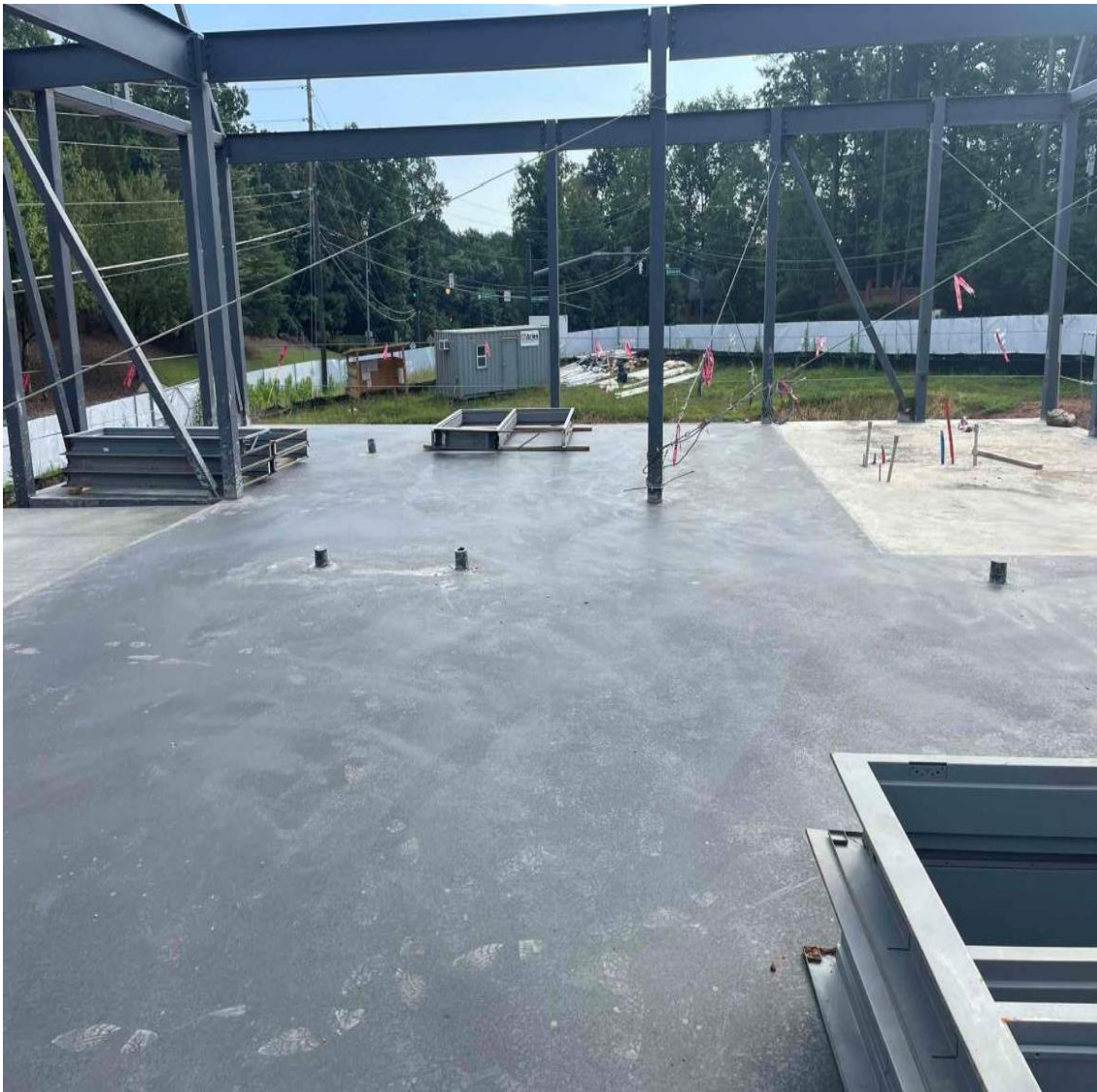
Elevated Slab on Deck Poured at the Second Floor