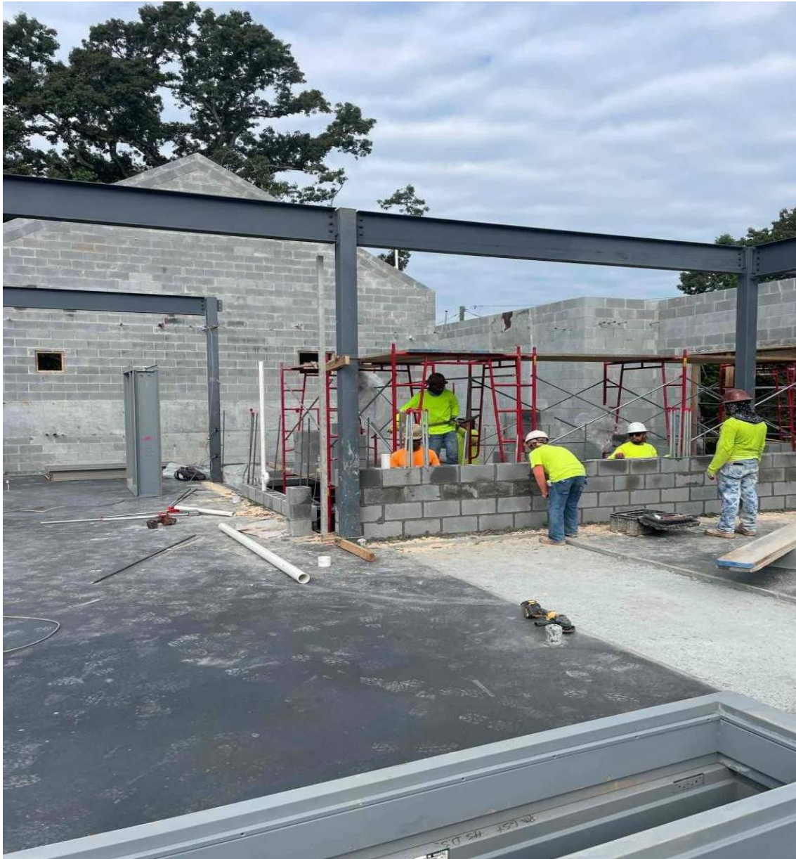
Continuing Installation of Interior CMU at the Stairwell