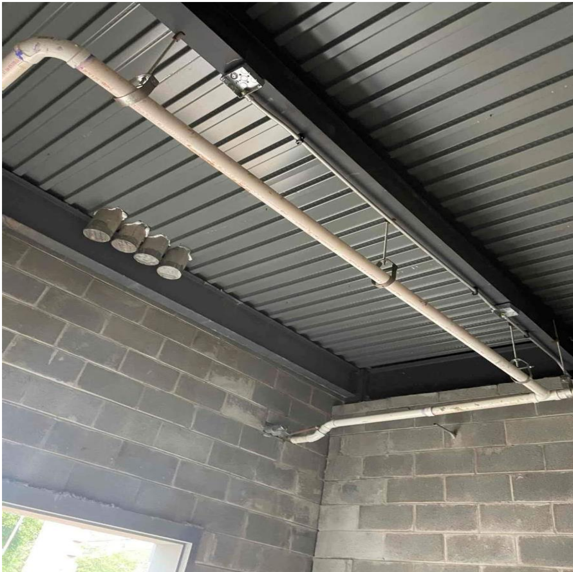
Continuing Overhead Rough-in