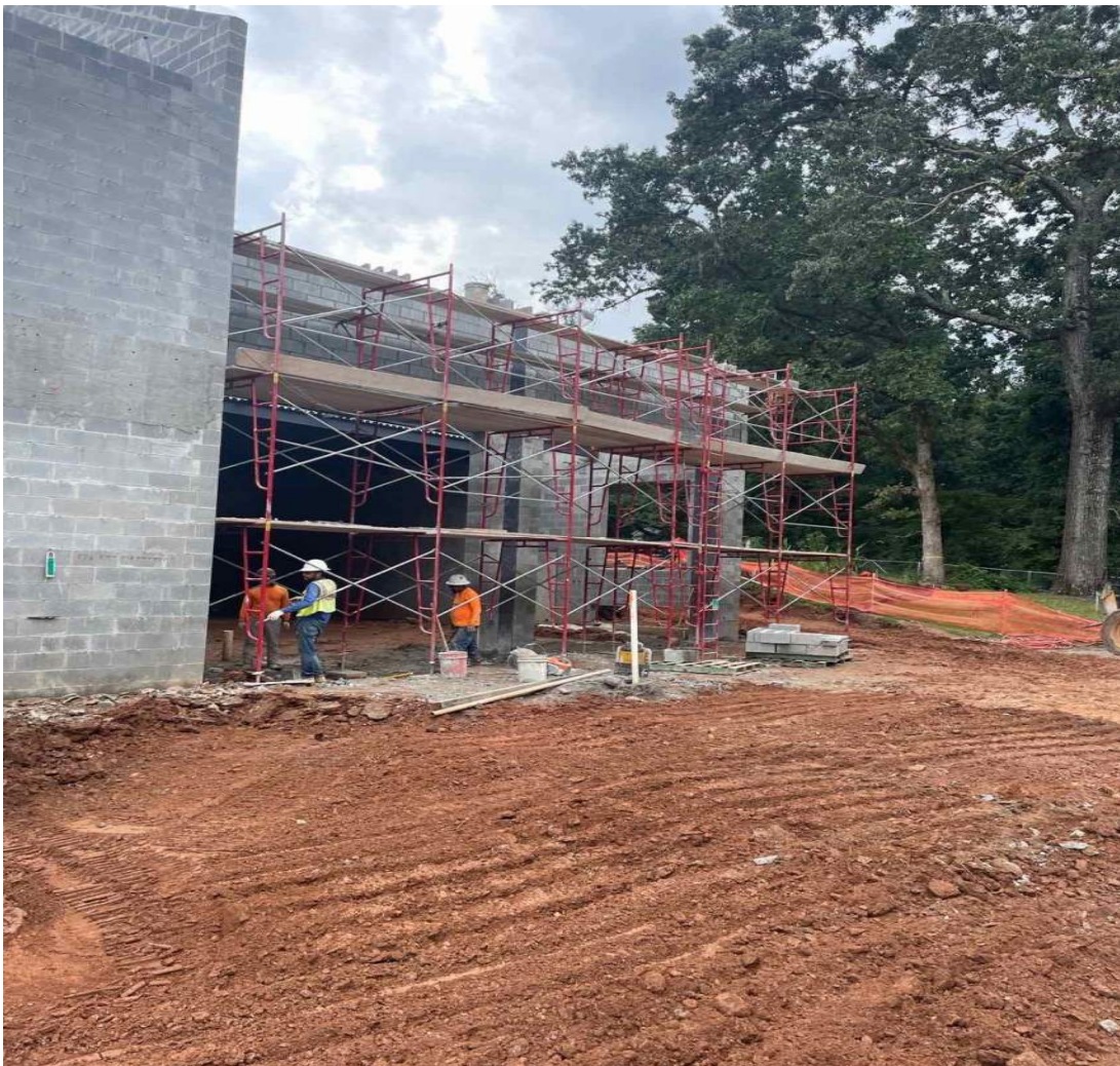
Continued Exterior CMU at the Apparatus Bay Doors