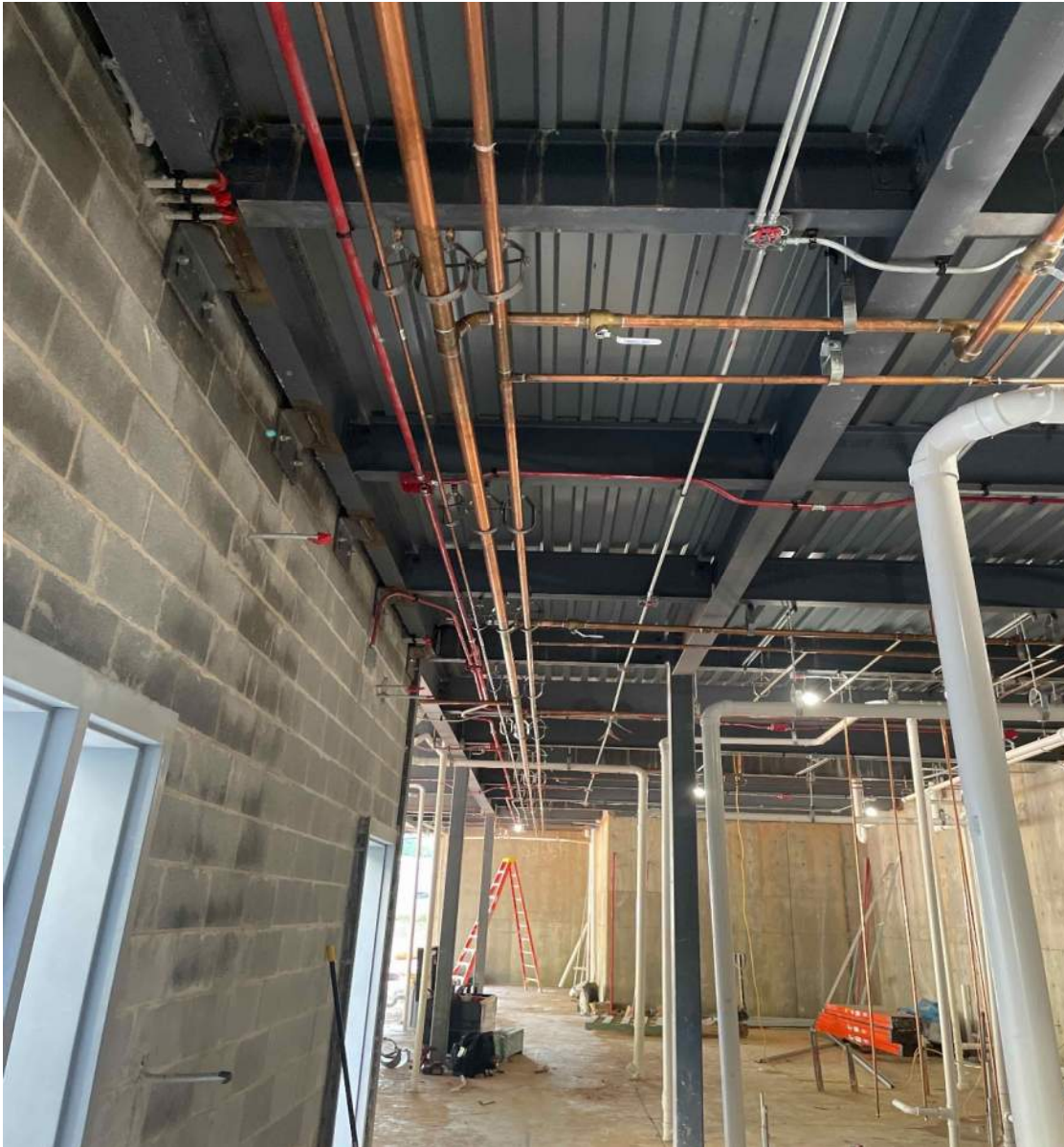
Continued MEP Overhead and In-wall Rough-in