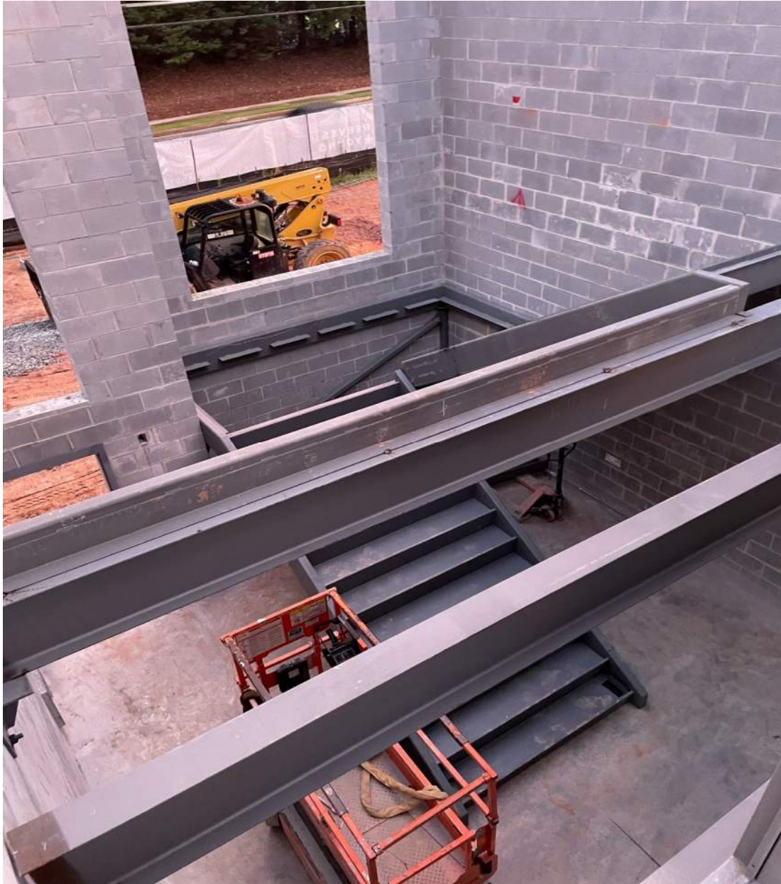
Installation of Metal Pan Stairs