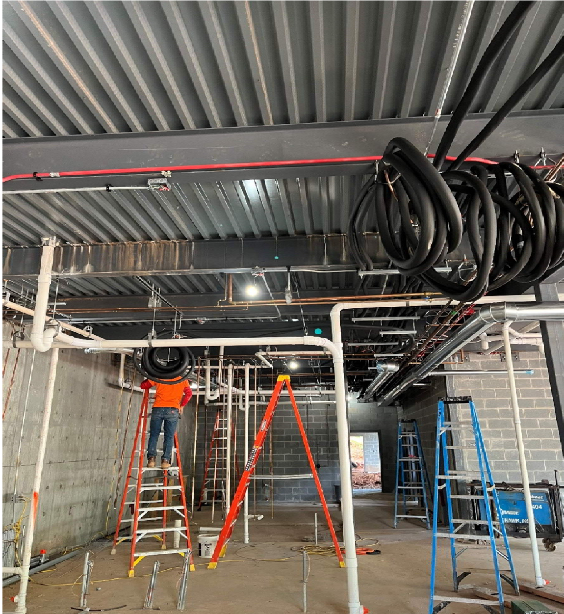
Continued MEP Rough in on first floor