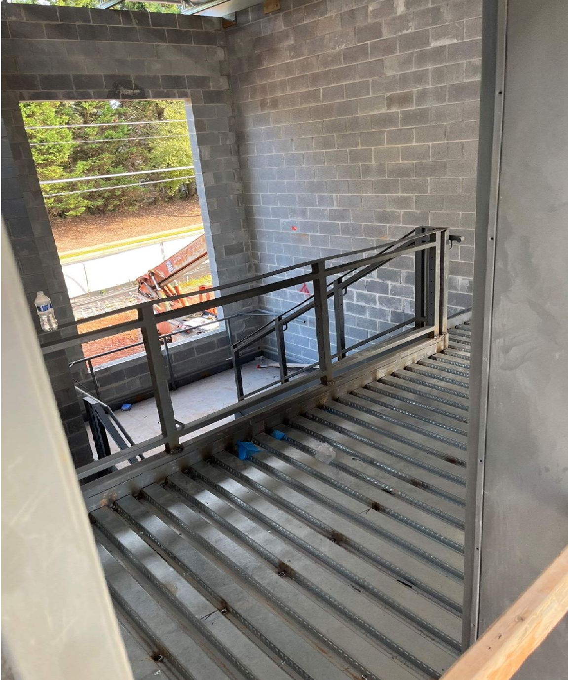
Continue Detailing Metal Pan Stairs