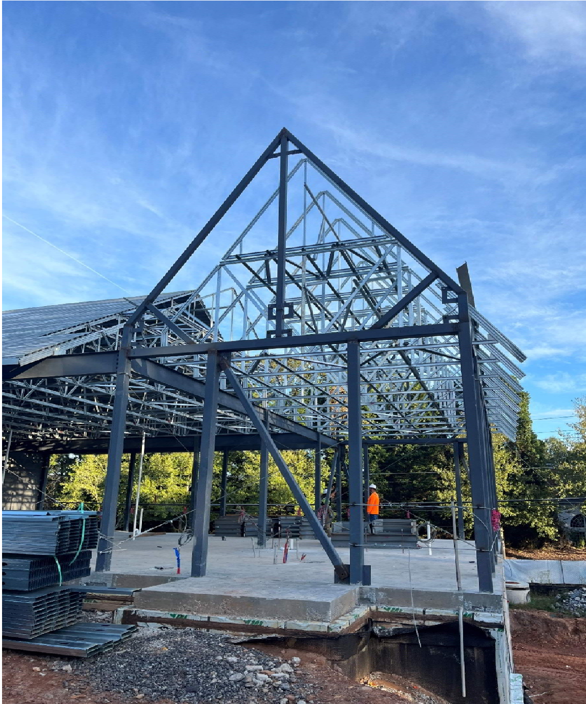
Continued Installation of Cold Form Trusses