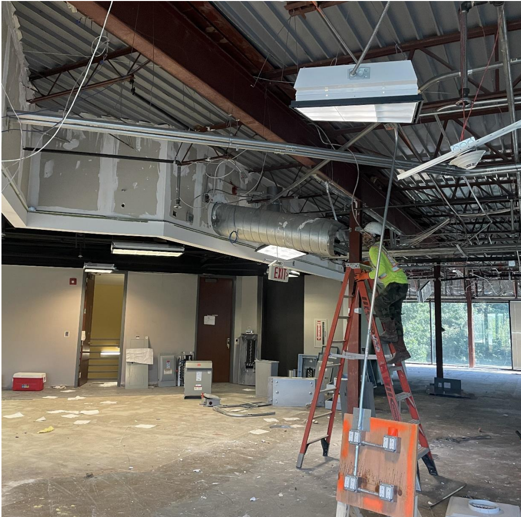
Connecting Temporary Light and Power