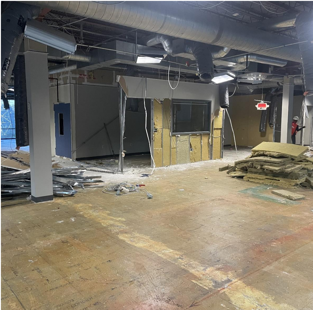
Demolishing Existing Conditions