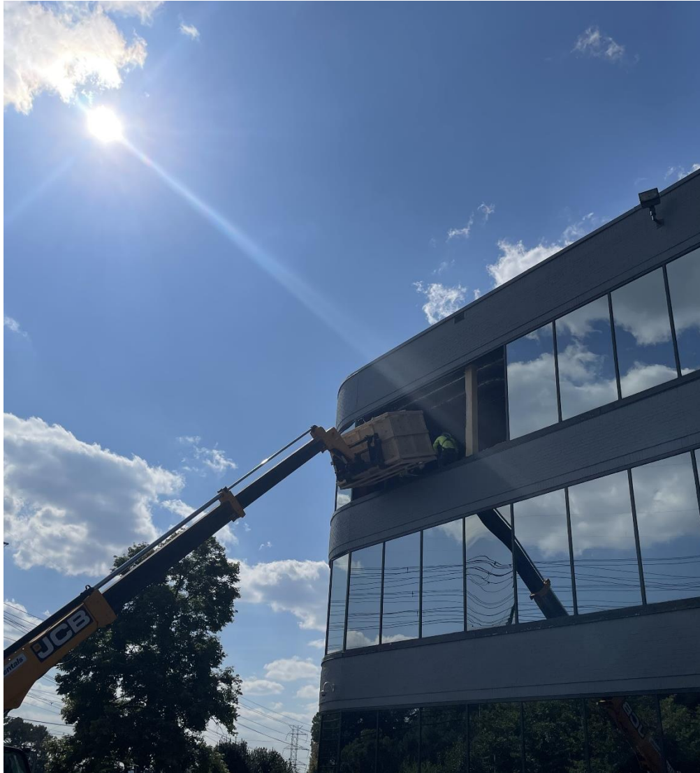
Exporting Demolished Materials