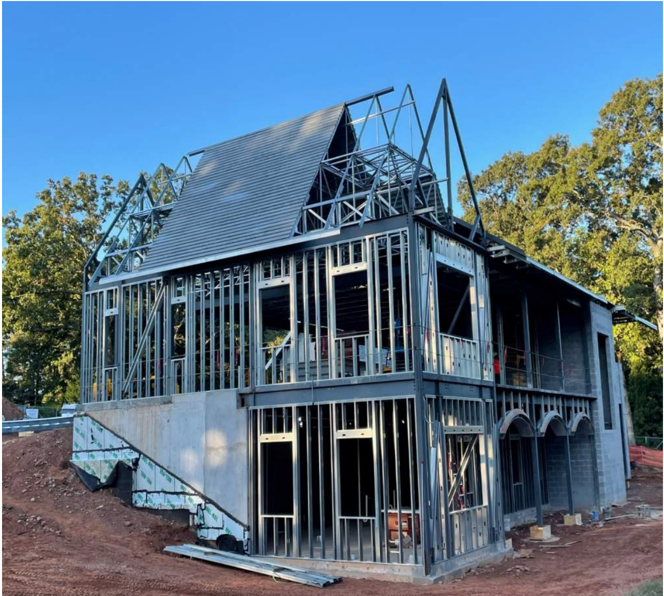
Continued Exterior Framing at the First and Second Floor