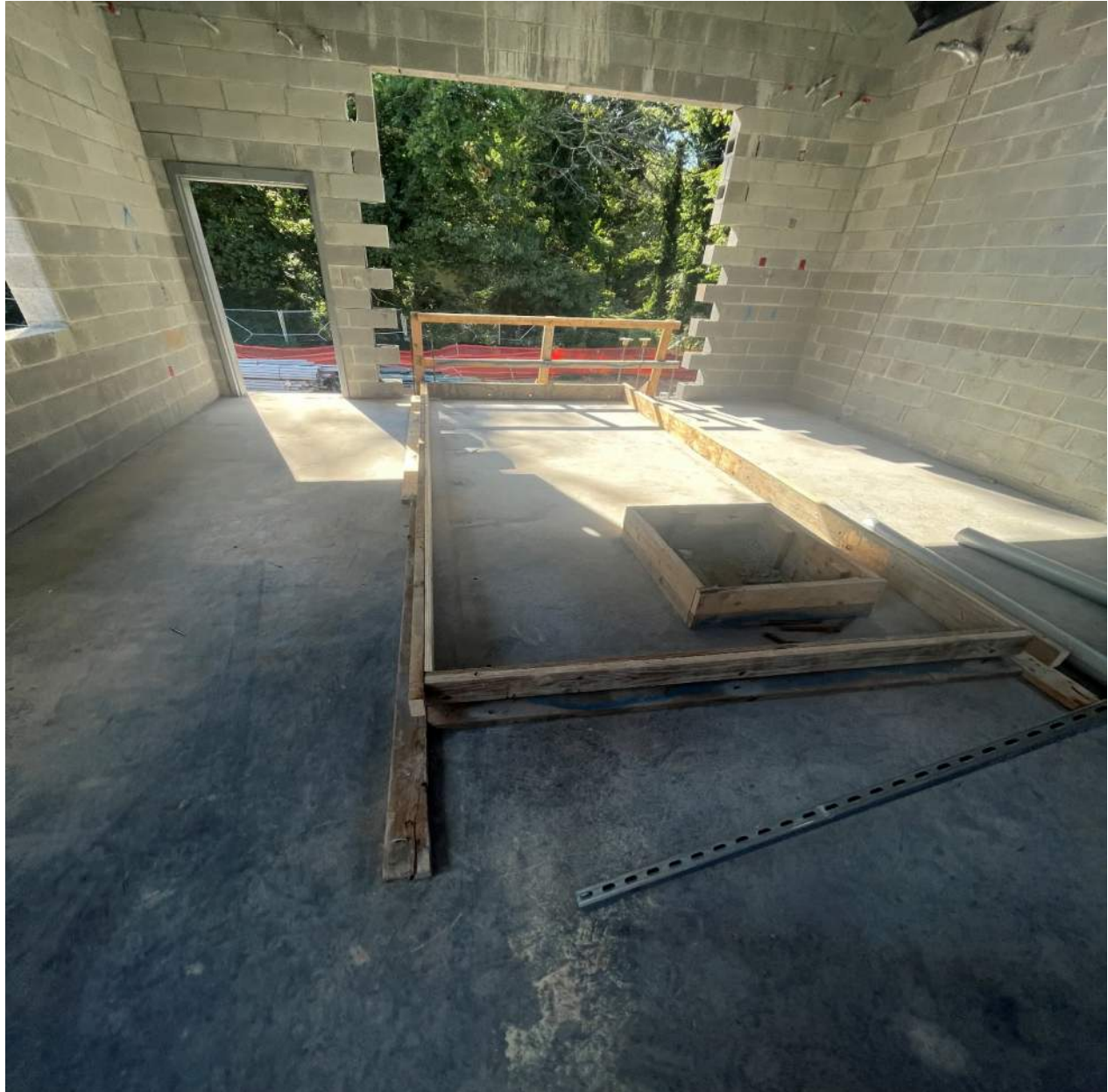
Formwork for Generator Pad at the Electrical Room