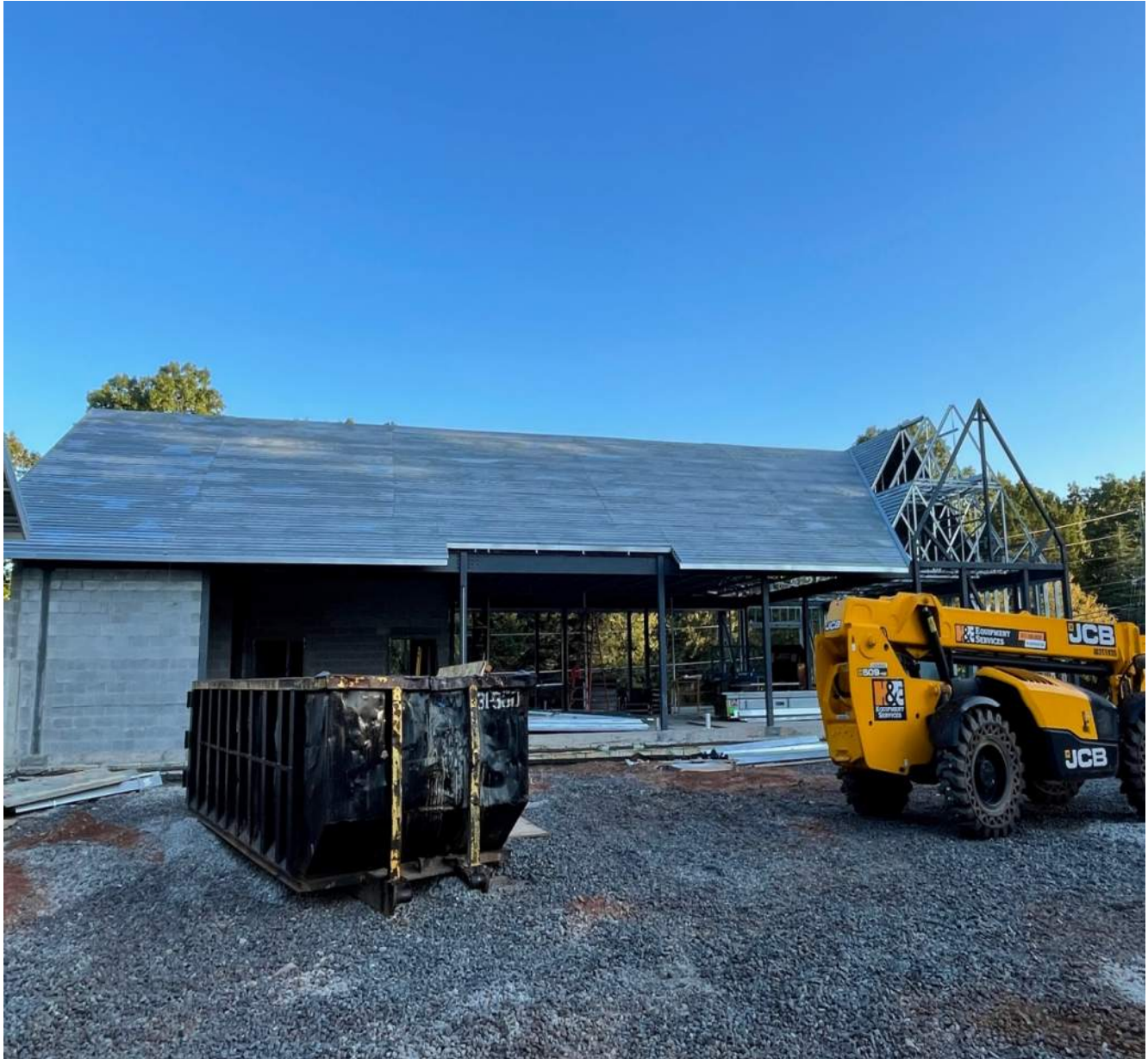
Continued Installation of Roof Decking