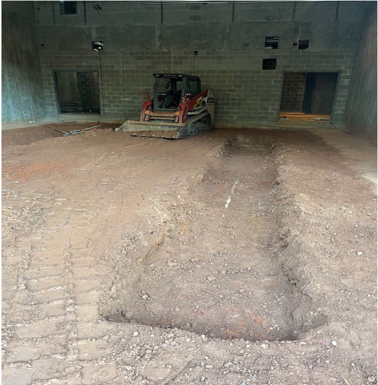
Prepping Apparatus Bay for Slab on Grade Pour