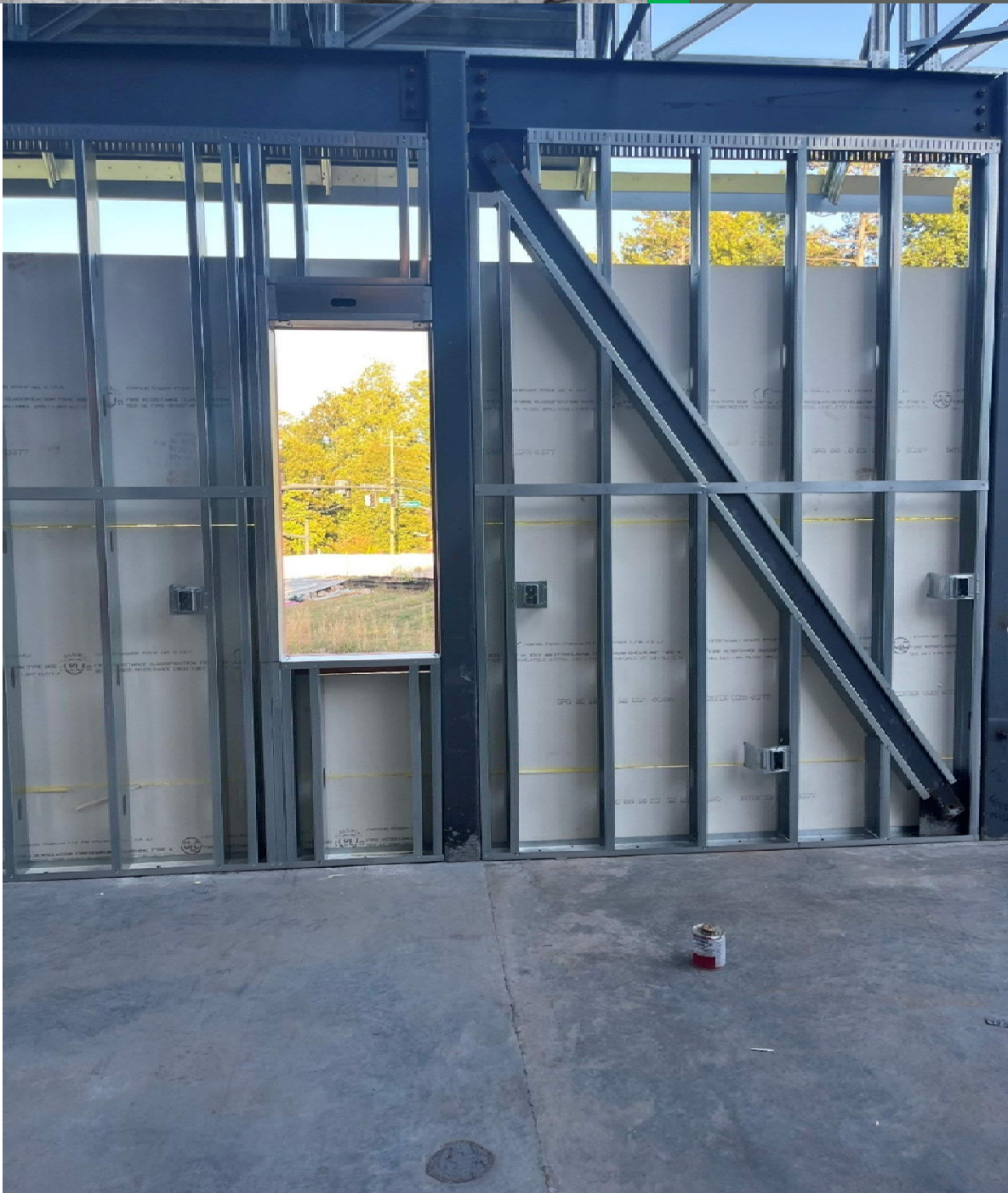
Continue MEP Inwall Rough In and Sheathing