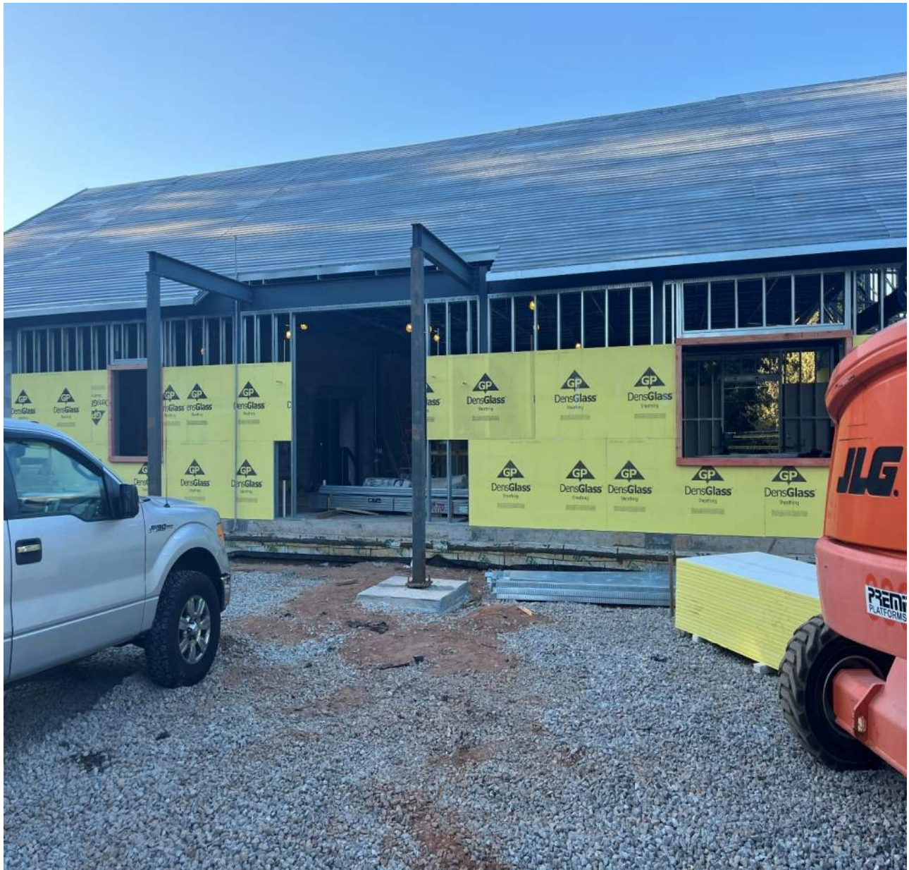
Sheathing Installation on Both First and Second Floor.