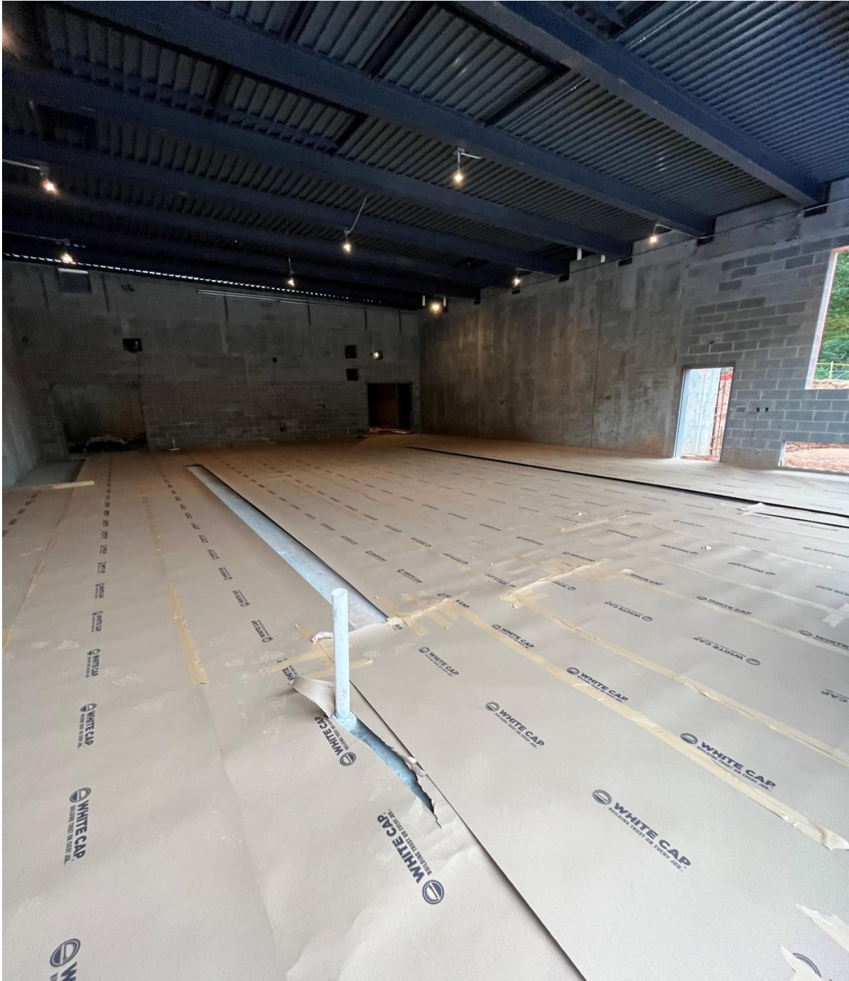
Completed Concrete Slab on Grade Pour and Floor Protection