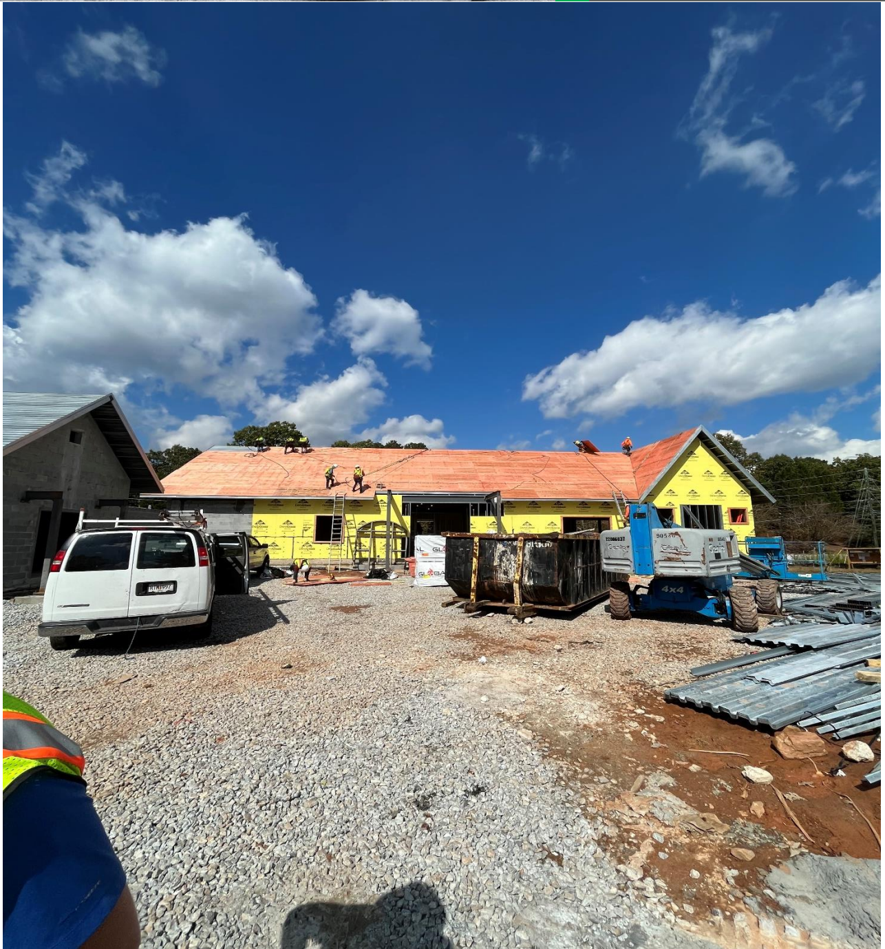
Asphalt Roof Underlayment Installation