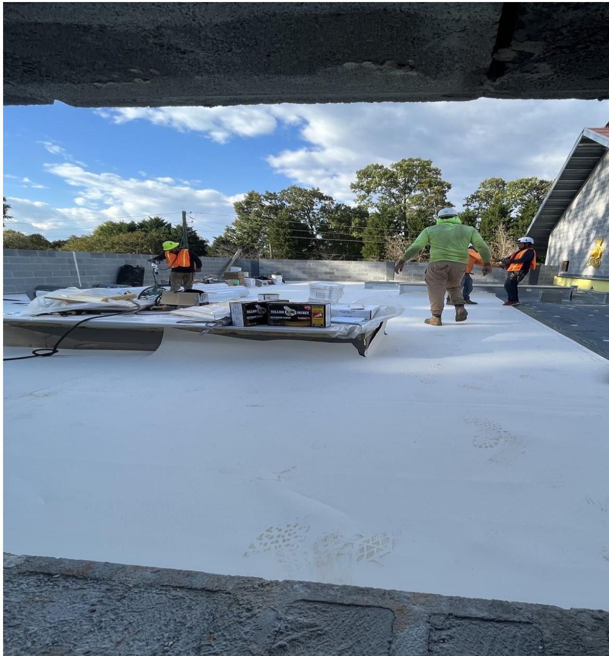
Installation of TPO Roofing at Apparatus Bay