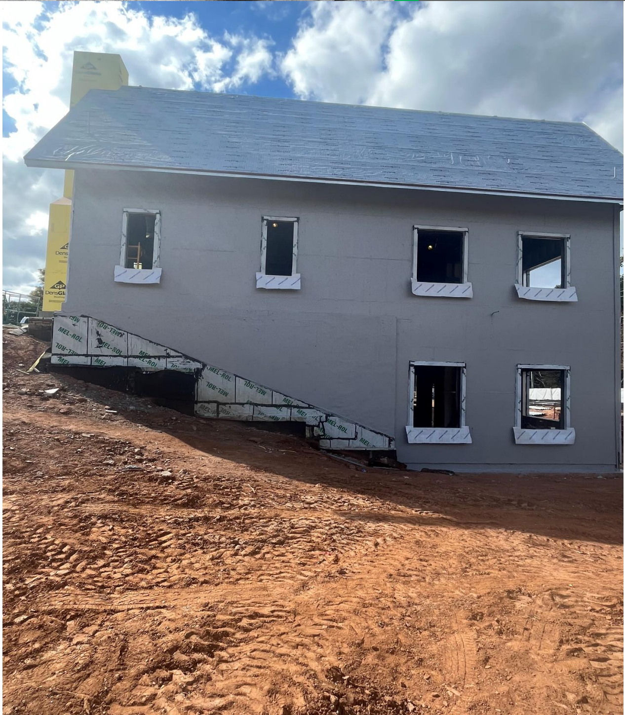
Installed Flashing on all First and Second Floor Windows