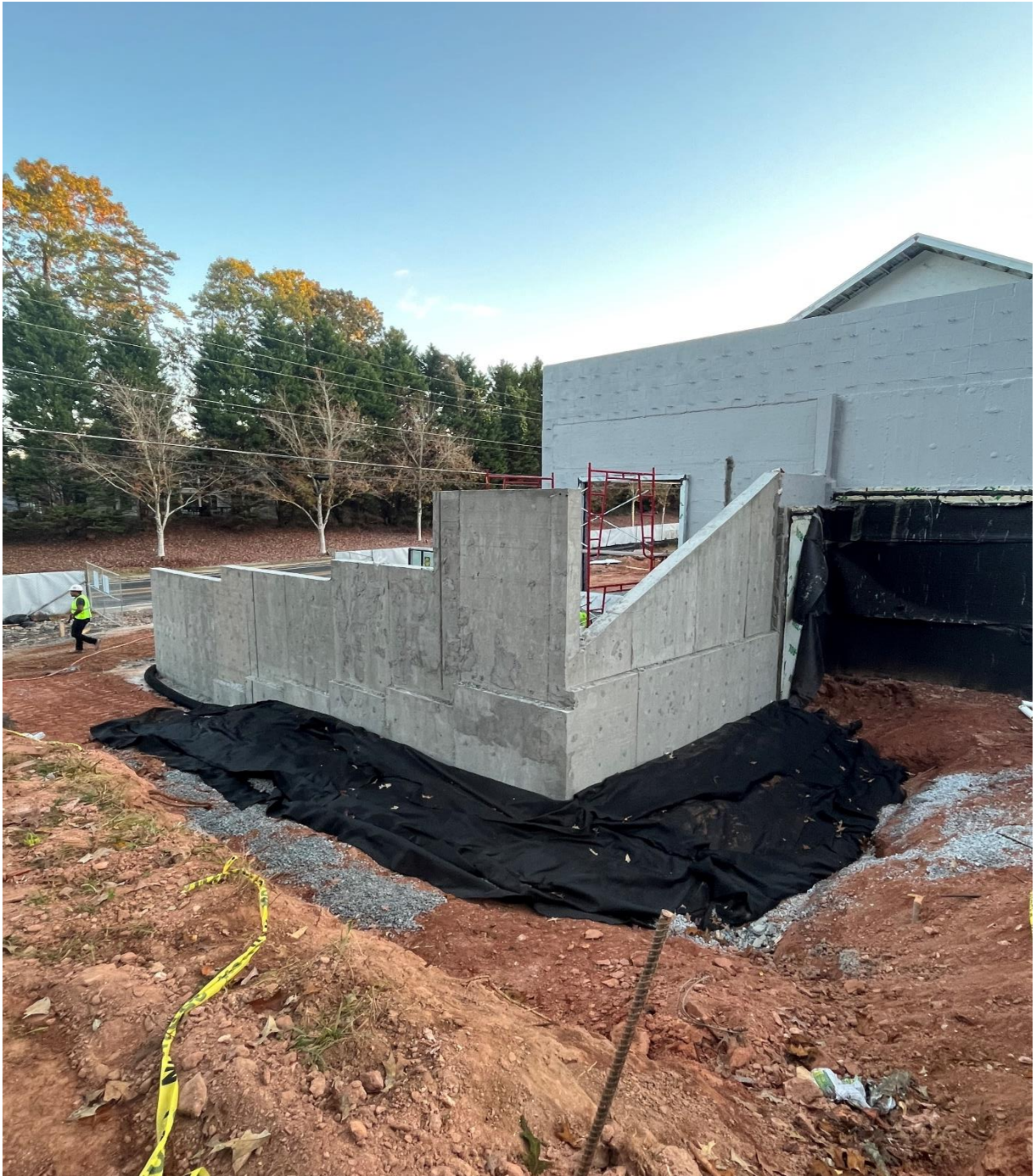
Completed Concrete Retaining Wall at Spalding Entrance