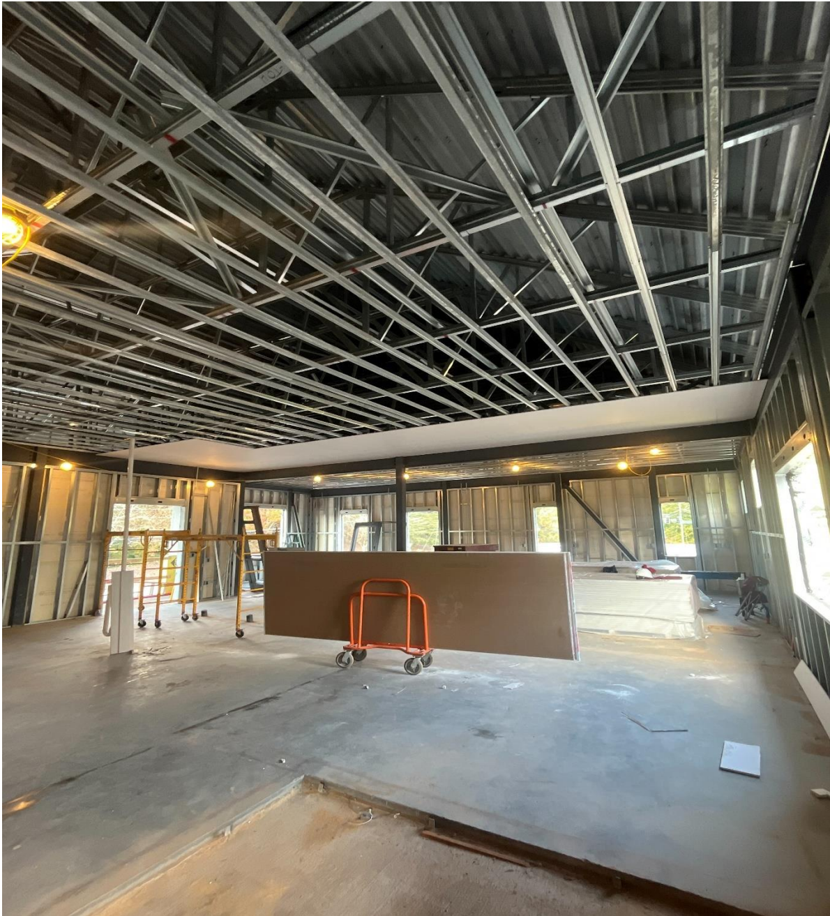
Completed Hack Channel Install and Began Sheet Rock Installation.