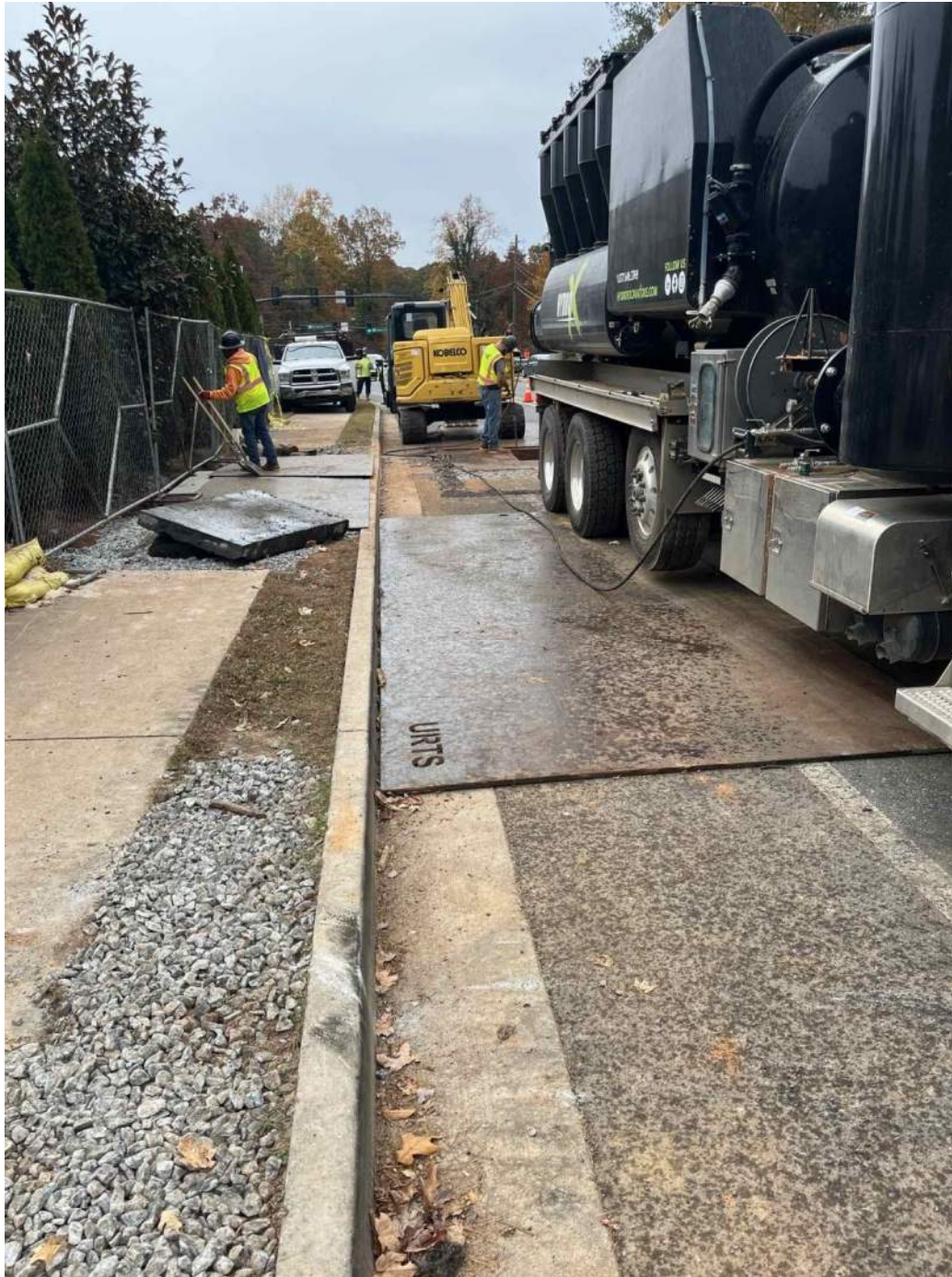
City of Atlanta Continued Working on Water Vault Install