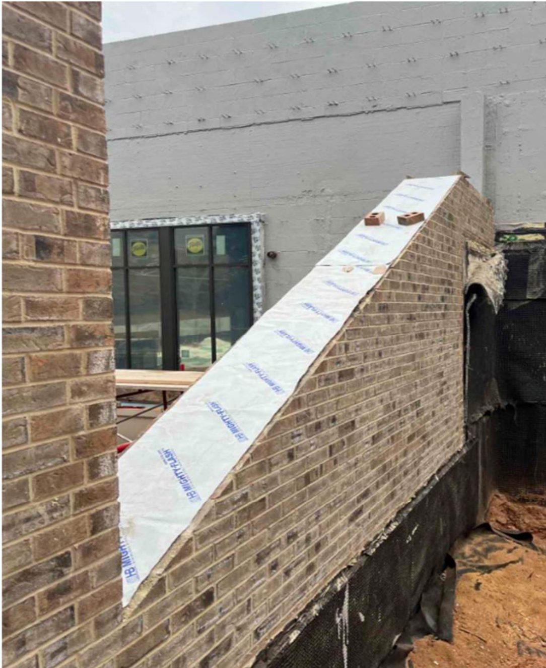
Continued Brick Veneer at Retaining Wall