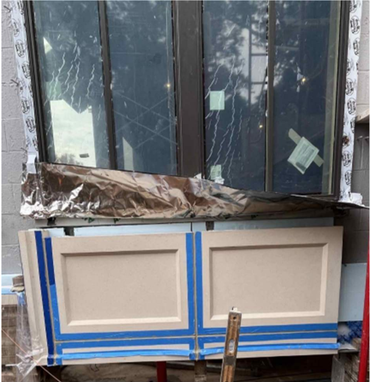
Continued Brick Mockup with Cast Stone