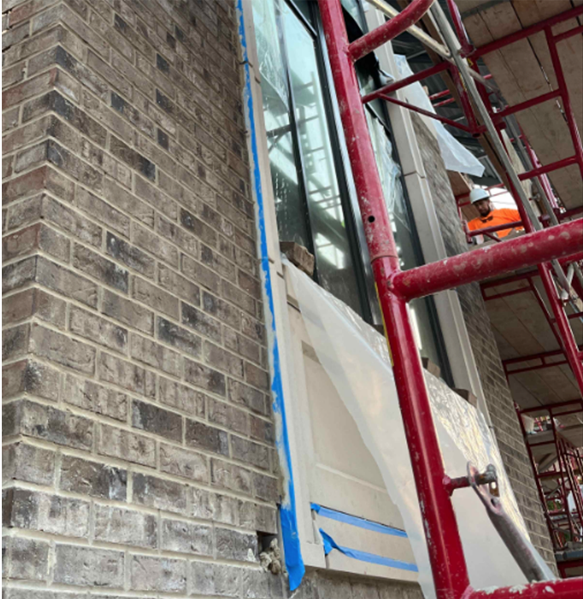
Continued Brick Veneer and Cast Stone Installation