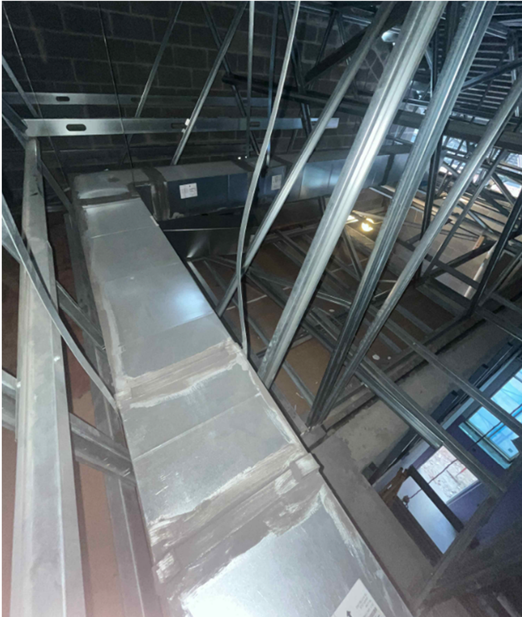
Continued Attic Space Duct Work Installation