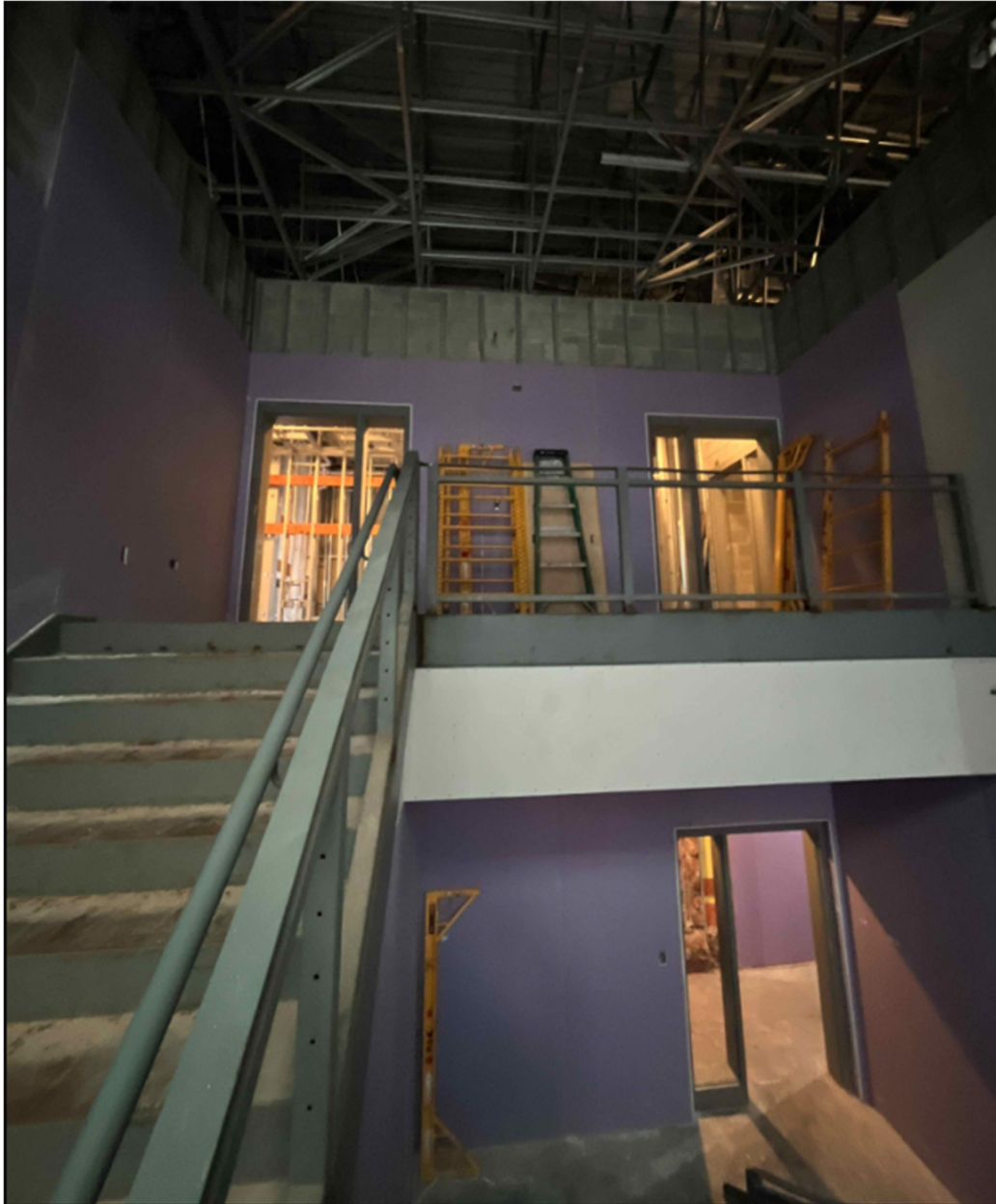
Continued High Impact Sheet Rock Installation in Stairwell