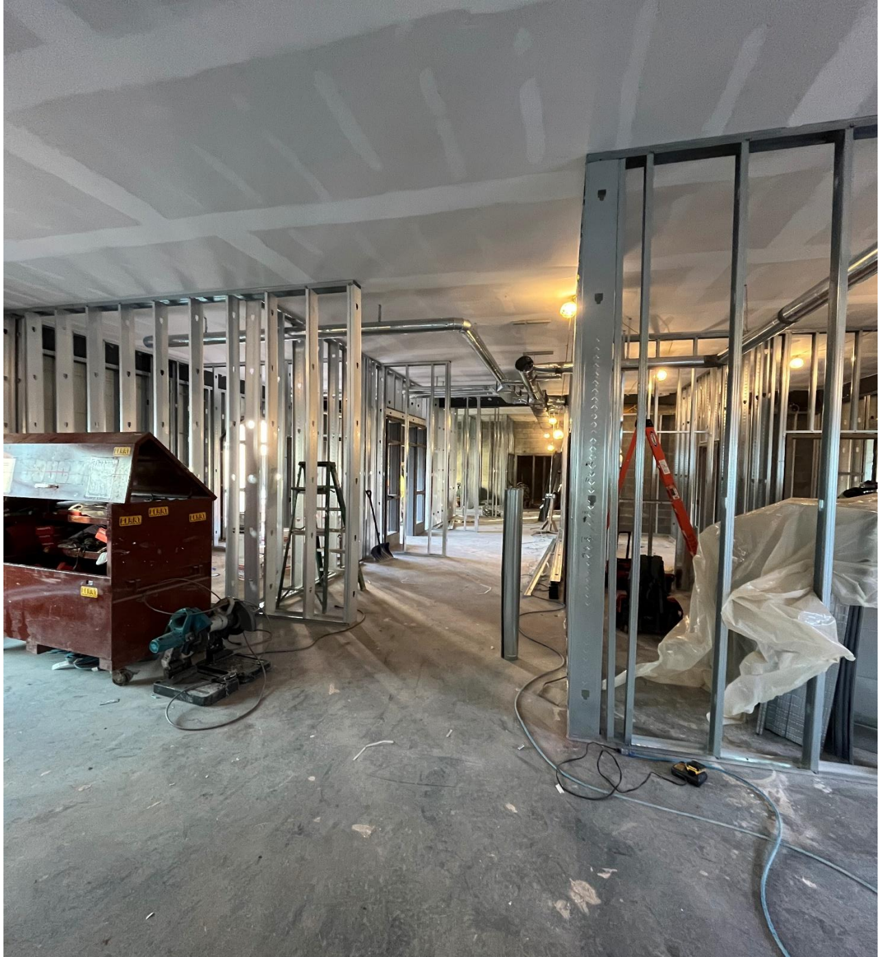
Continued Second Floor Interior Installation on Second Floor.