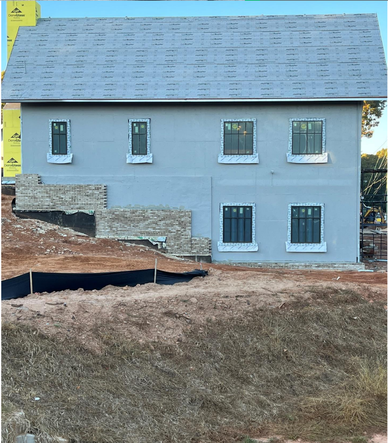
Began Window Installation on the First and Second Floor.