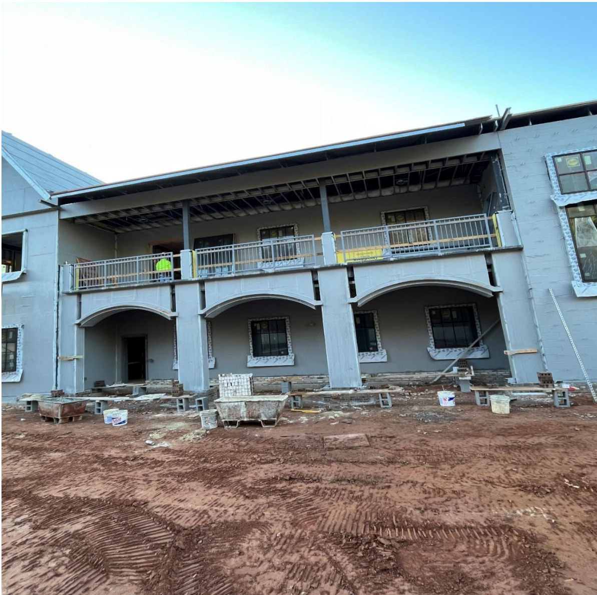
Completed Metal Railing Installation at Second Floor Porch.