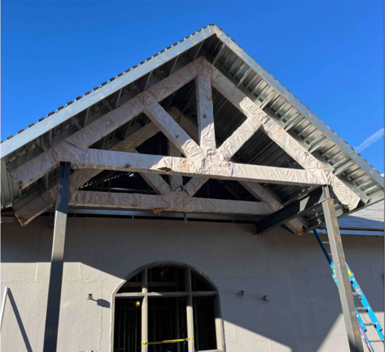
Heavy Timber Trusses Installed