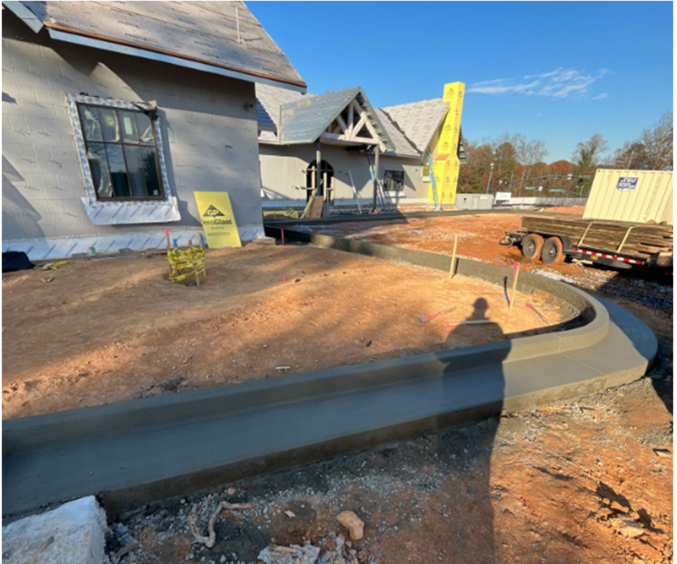
Curb and Gutter Completed at Mt Vernon