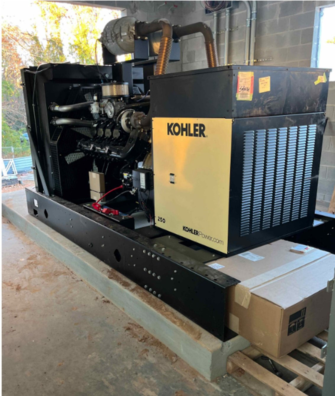
Generator Installed in Generator Room