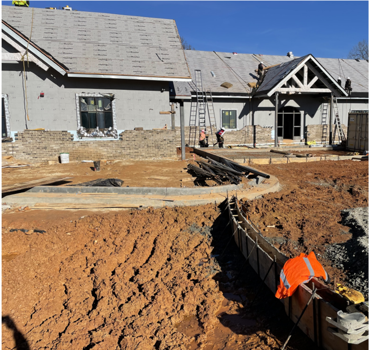
Began Installing Header Curb and Sleaving and Prep for Mt Vernon Parking Lot