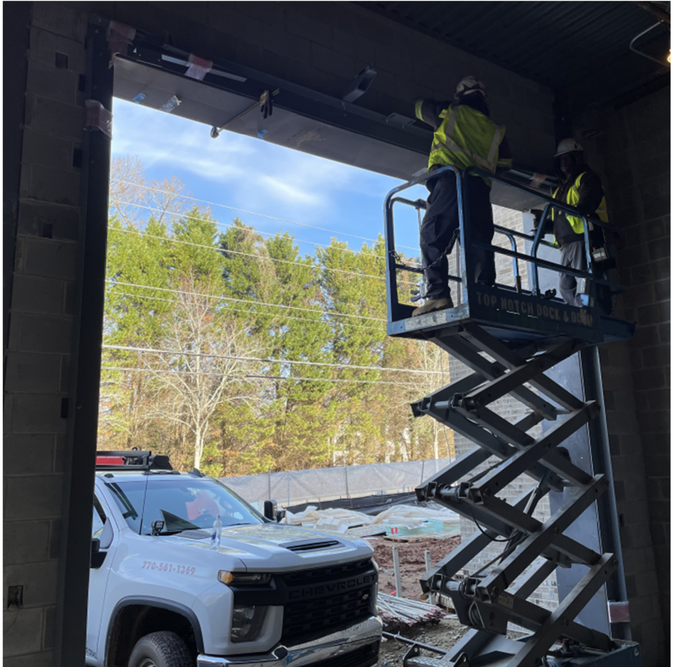
Began Installing Bifold Doors at Apparatus Bay