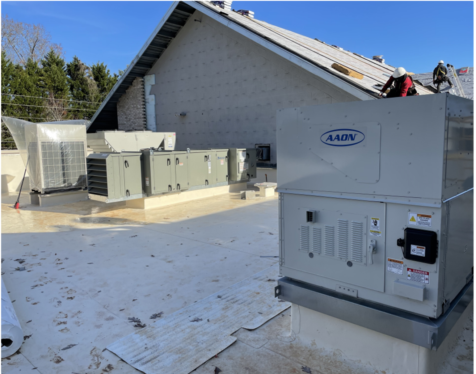
HVAC Rooftop Units Were Installed