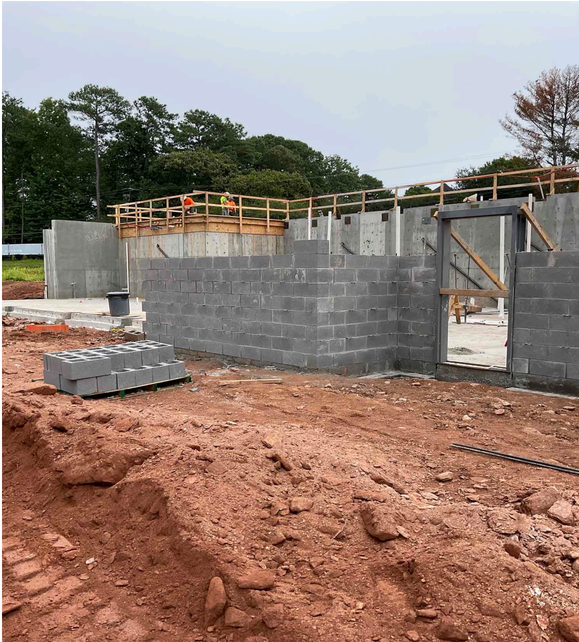
Exterior Concrete Masonry at Level 1