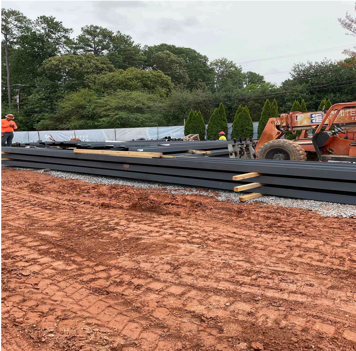
Structural Steel Delivery