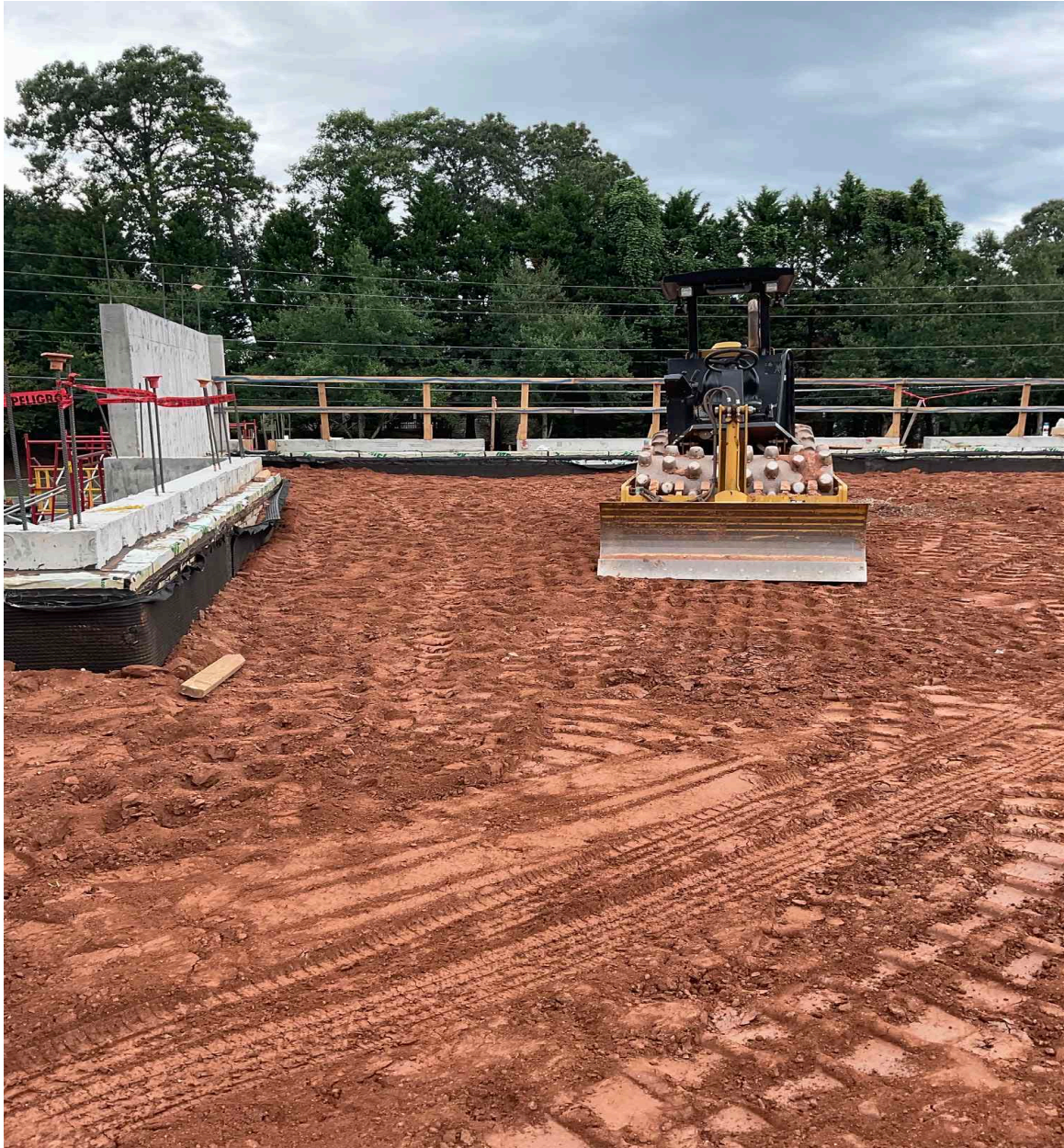
Backfill at Foundation Wall