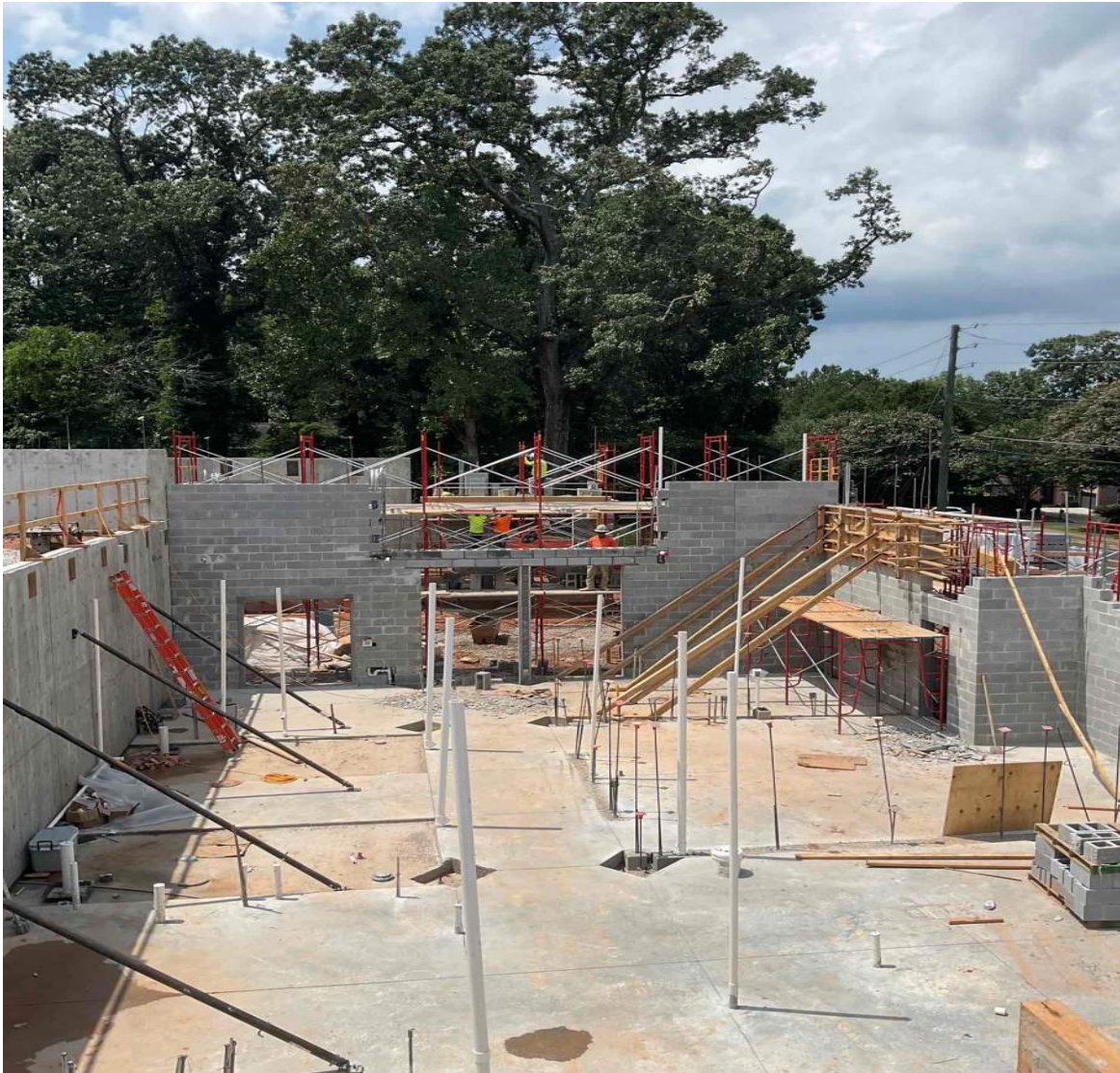
Exterior Concrete Masonry/ Rough-in at Level 1