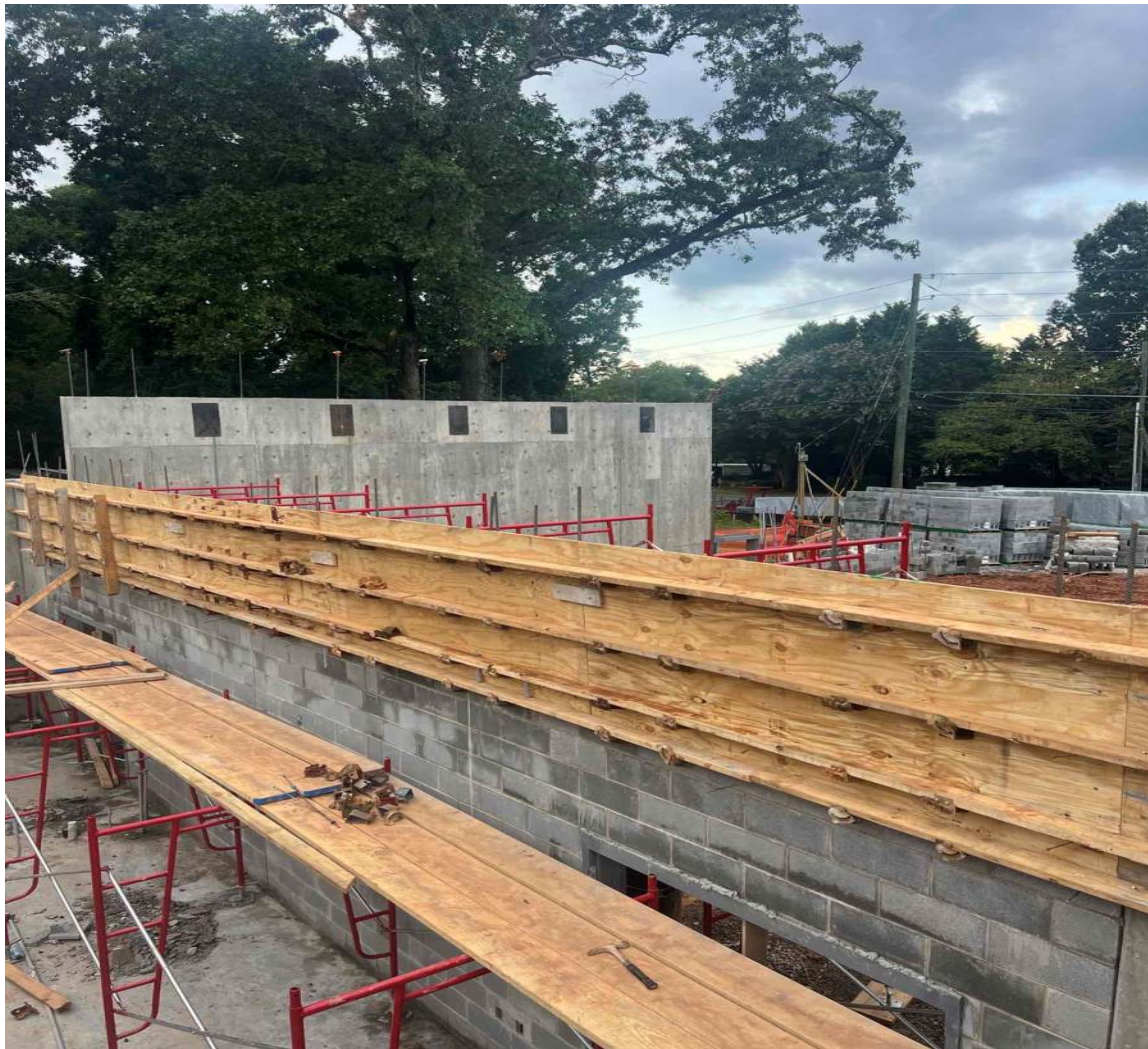
Formwork for CIP Lintels at the Apparatus Bay