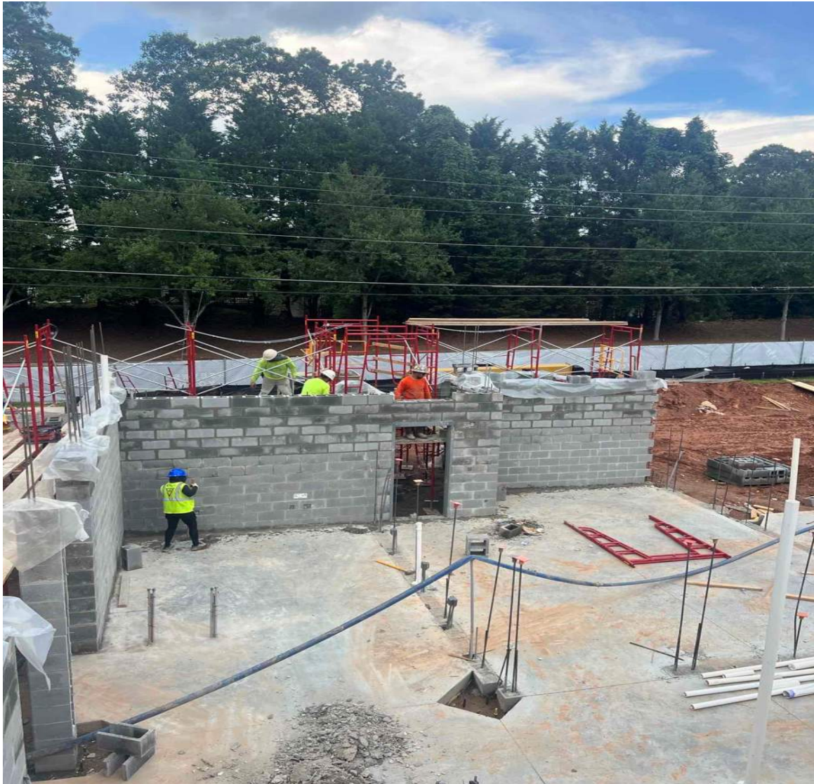
Exterior CMU Installation at the First Floor