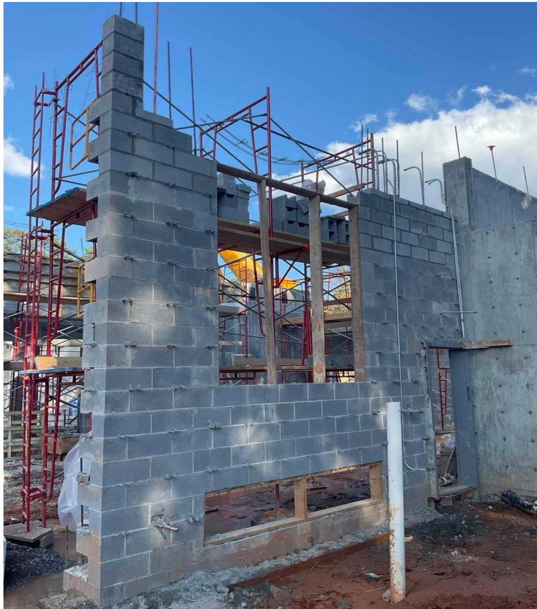
Continuing Installation of Exterior CMU