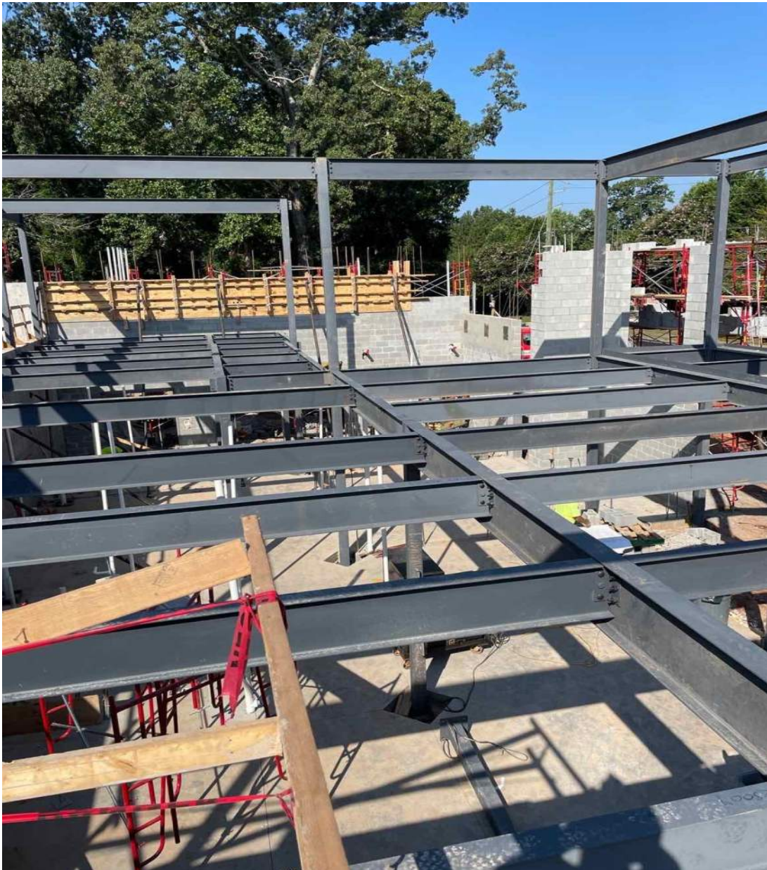
Structural Steel Second Floor