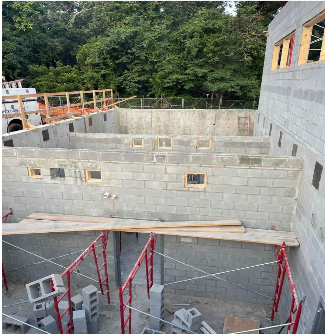
Interior CMU Installation at the First Floor Decon Area