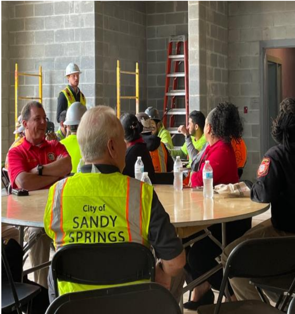
Hosted On-Site Thanksgiving Lunch for Subcontractors, City of Sandy Springs, and Fire Department