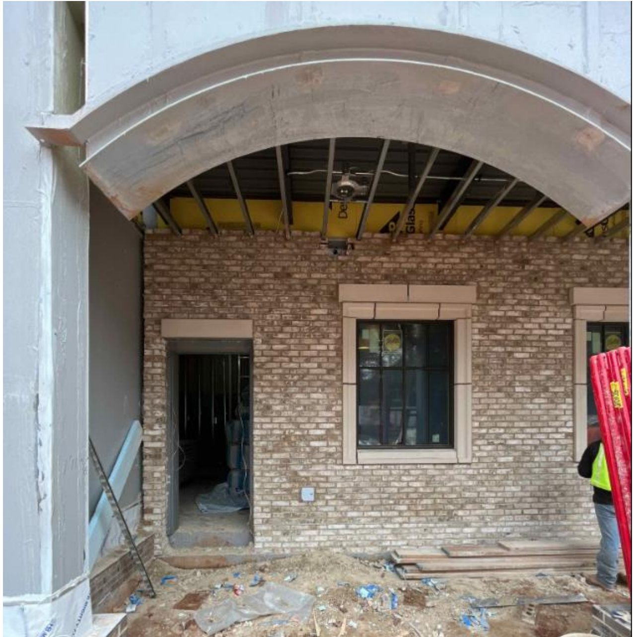
Continued Brick and Cast Stone Installation