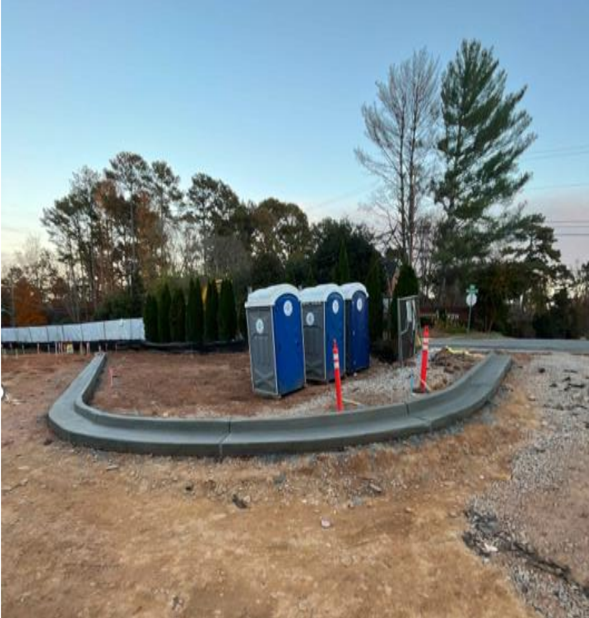
Poured Curb and Gutter at Mt Vernon Entrance