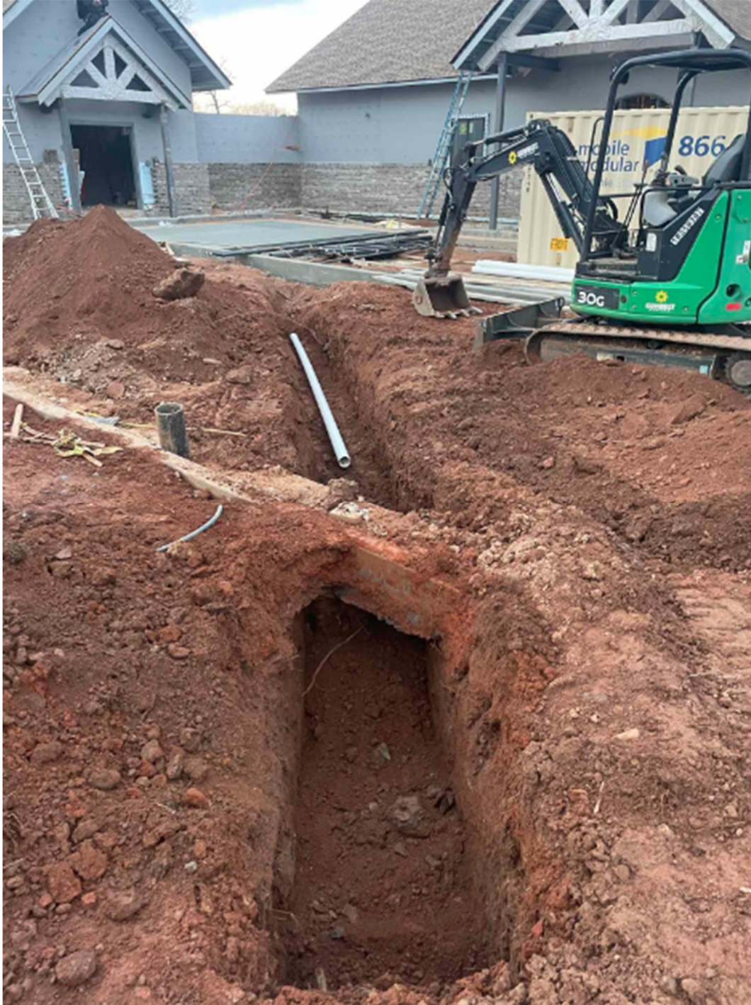
Completed Header Curb and Sleeving and Prep at Mt Vernon Parking Lot