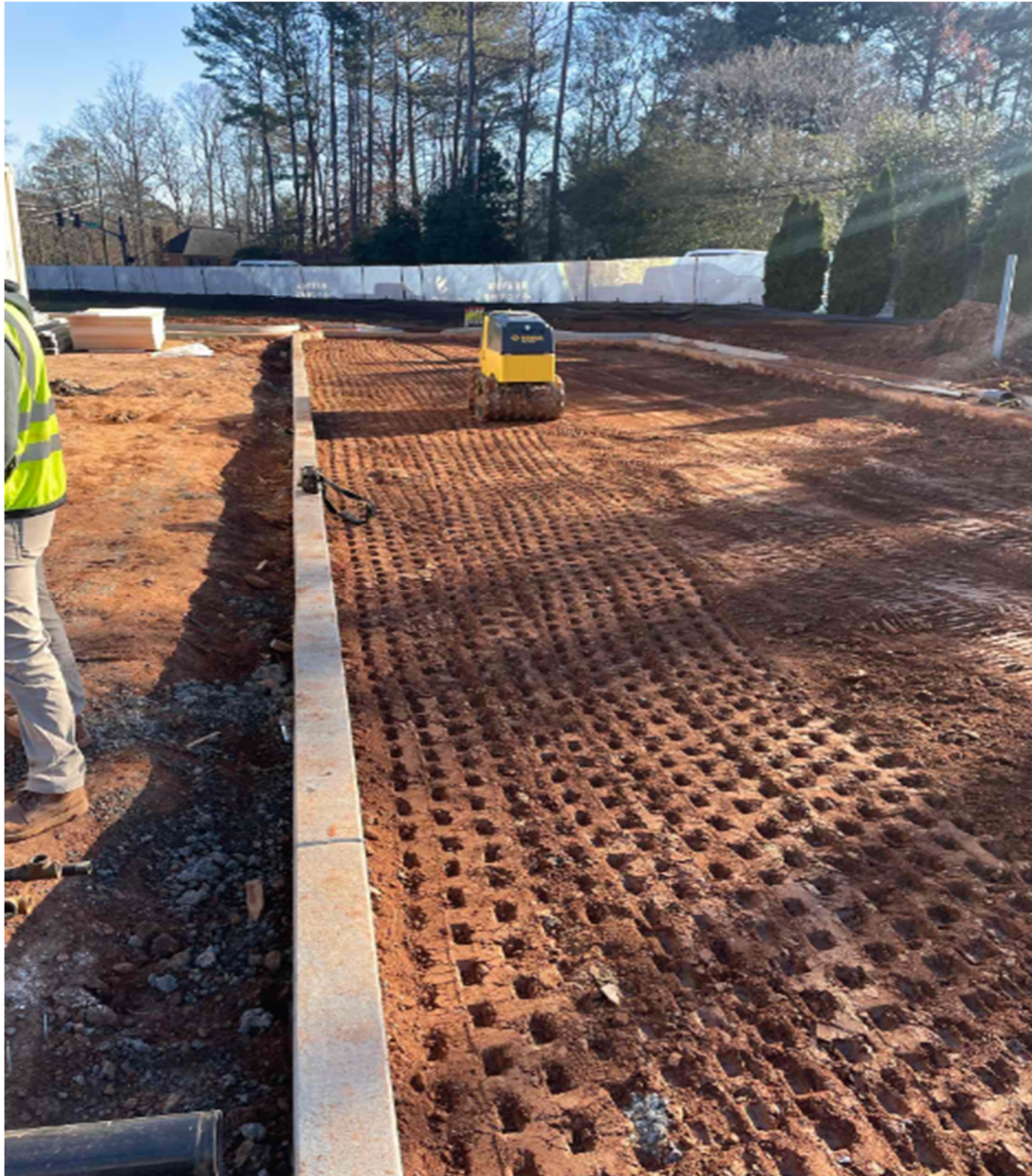
Began Grading for Asphalt Parking Lot