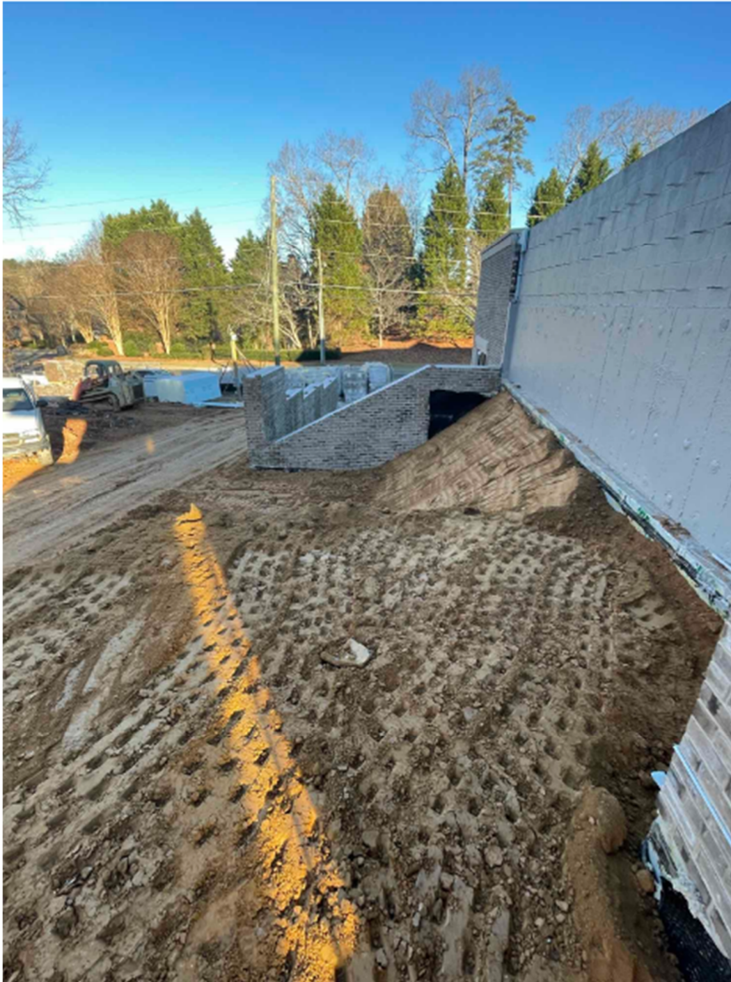
Began Backfilling on the east side of the building