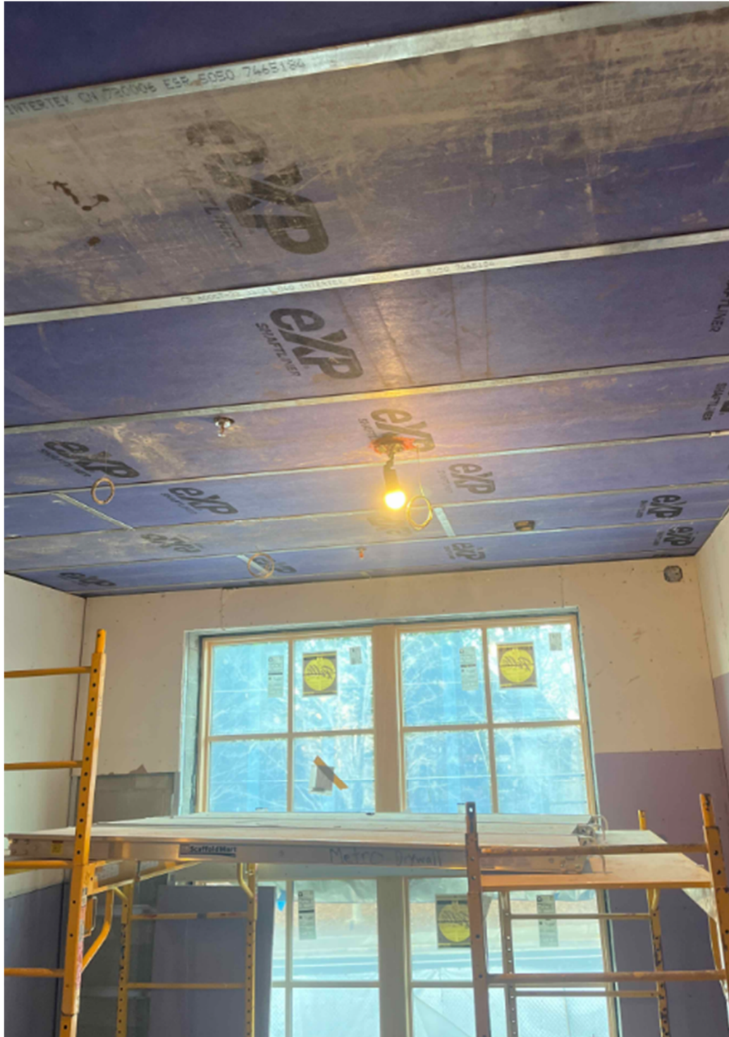
Continued Installing Hard Ceiling in Stairwell