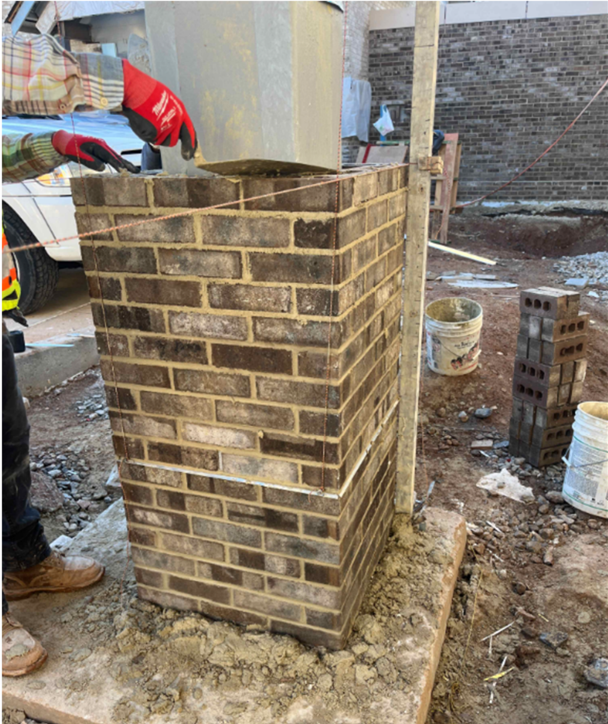
Began Installing Exterior Brick Columns