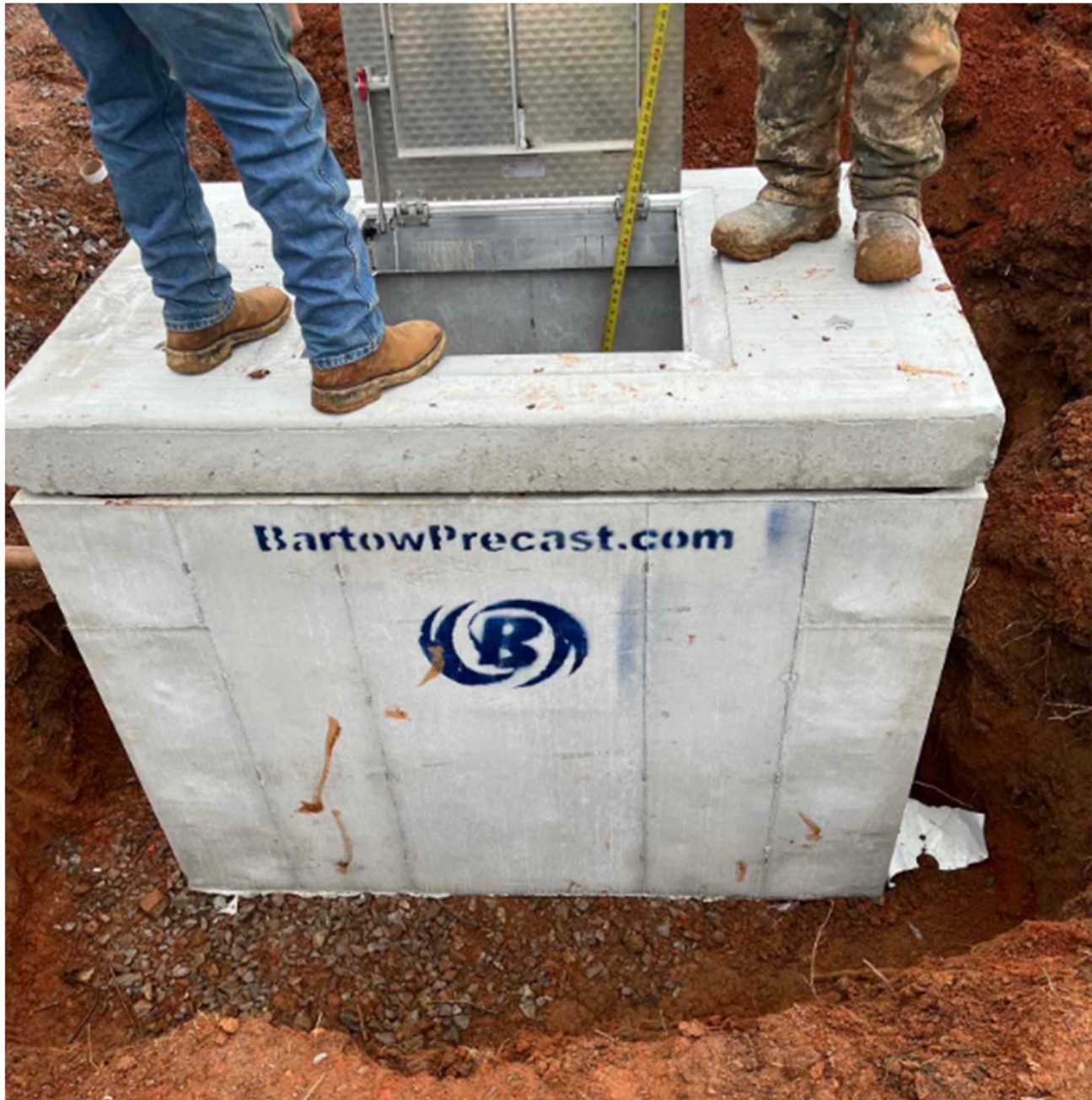
Installed Water Vault and Continued Storm Piping