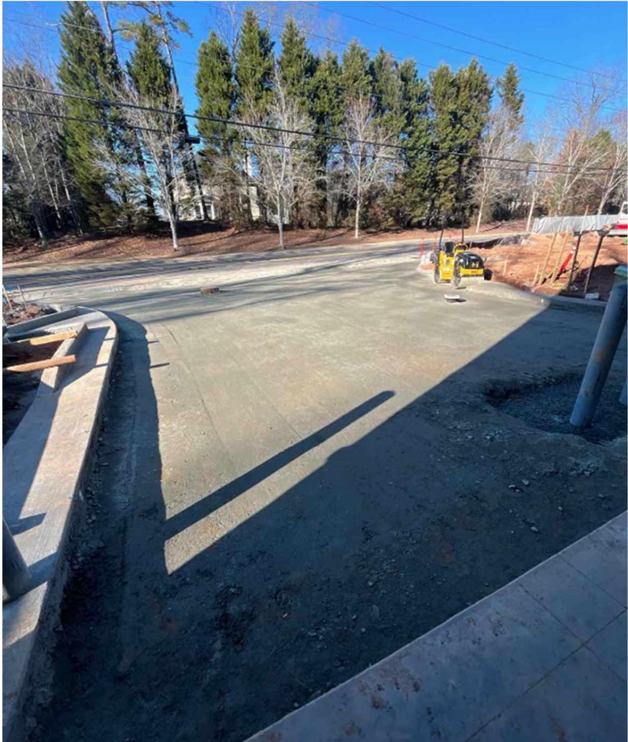
Began Prepping for Concrete Apron at Spalding Dr Entrance and Apparatus Bay