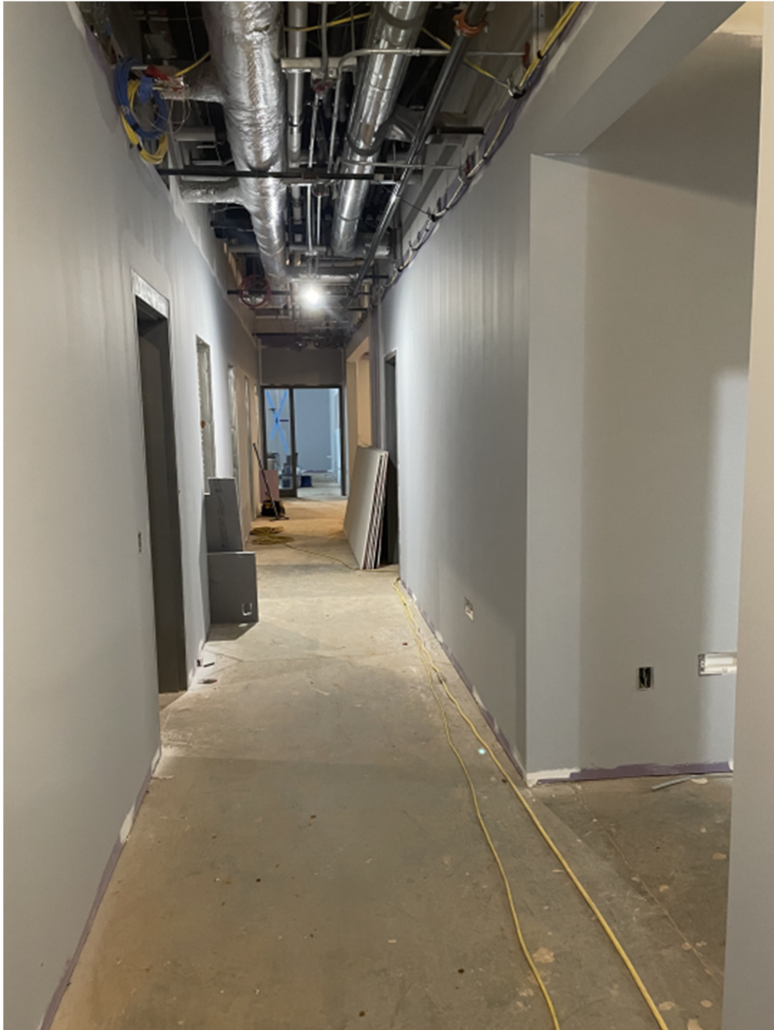
Began Priming for Paint on First Floor