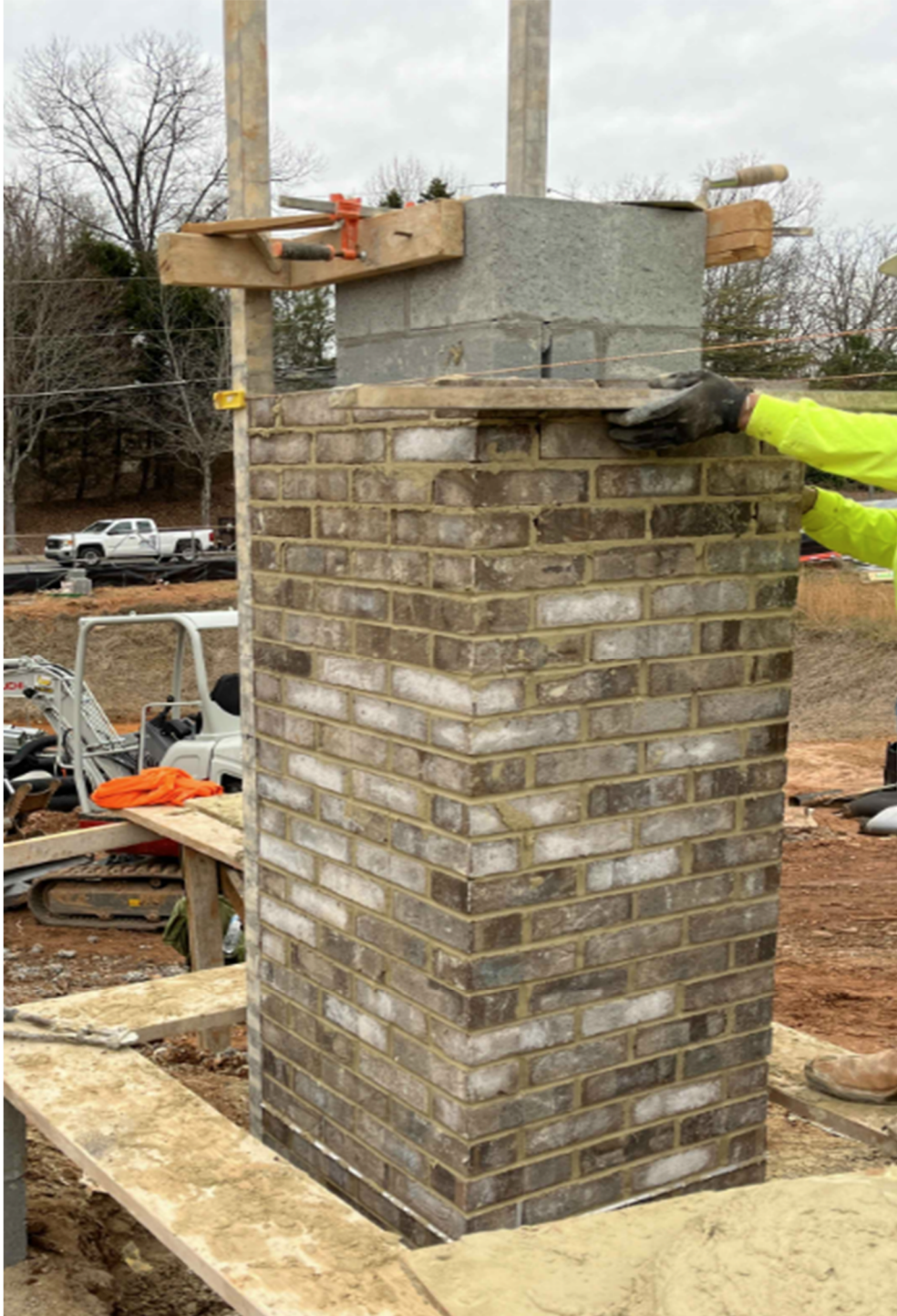
Began Installing Brick Veneer and Cast Stone Pillars for Site Fencing