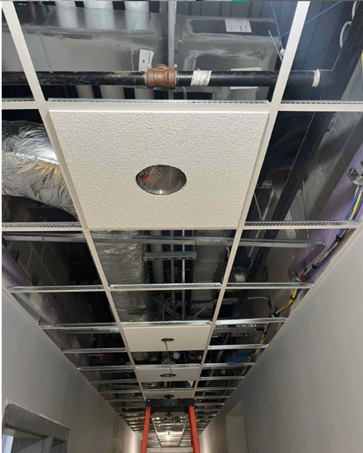
Began Installing Acoustical Ceiling Tile on First Floor