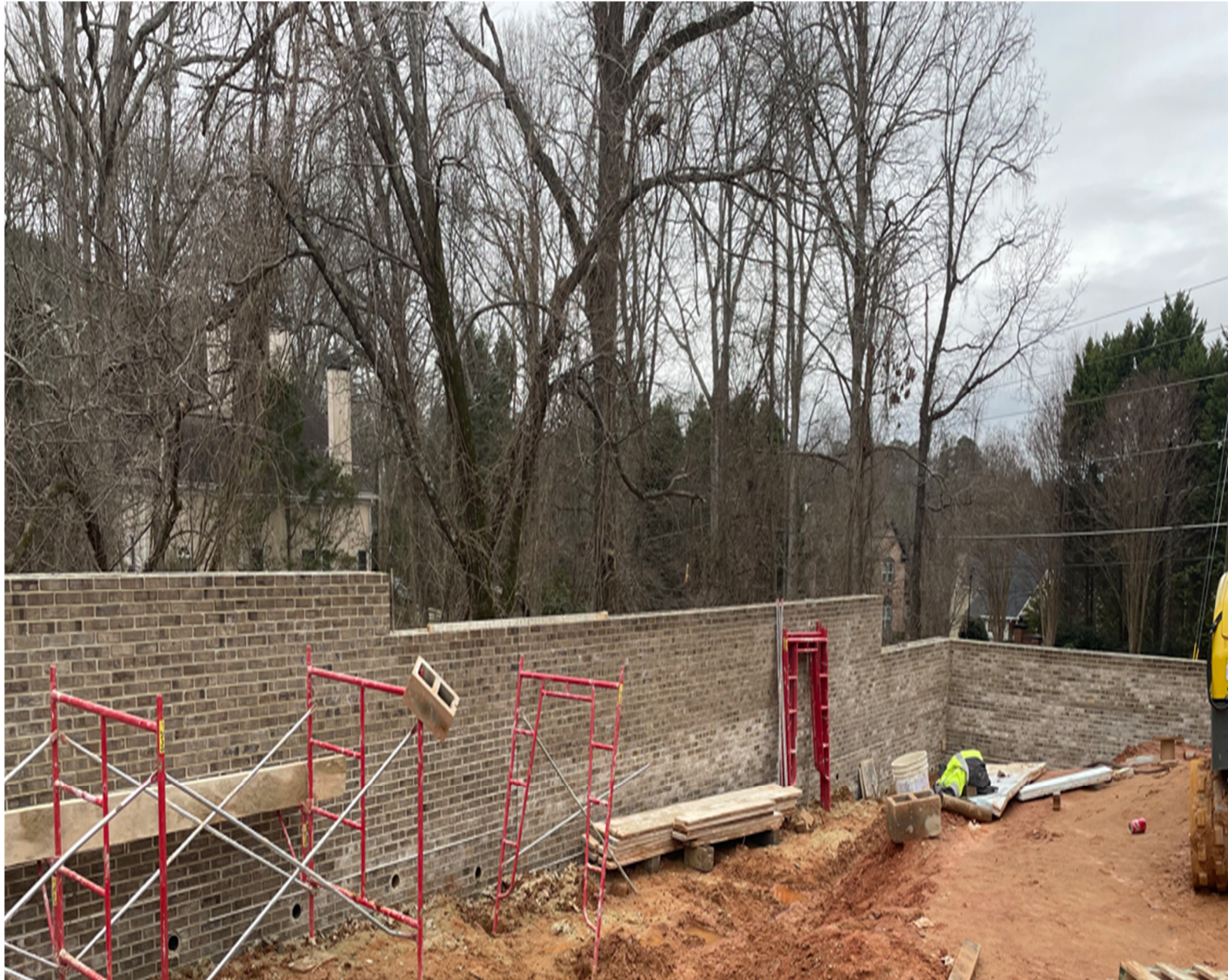
Continued Screen Wall Installation