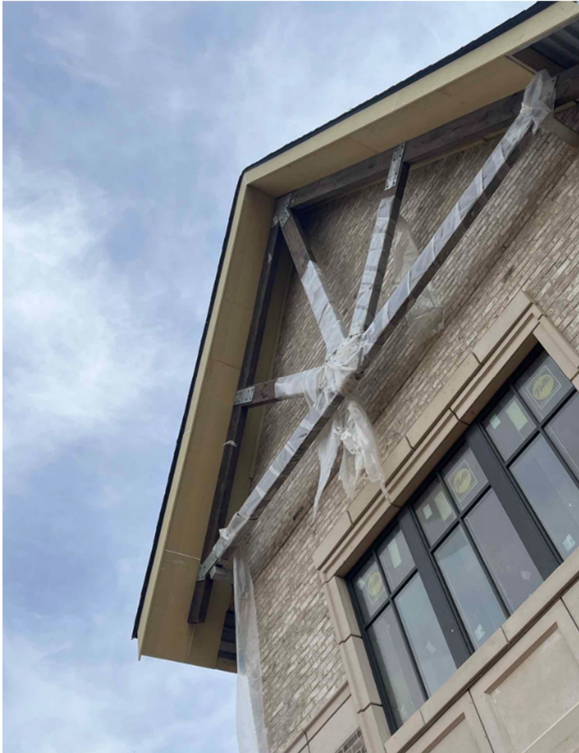
Continued Sub-Framing and Fiber Cement Soffit and Siding Installation