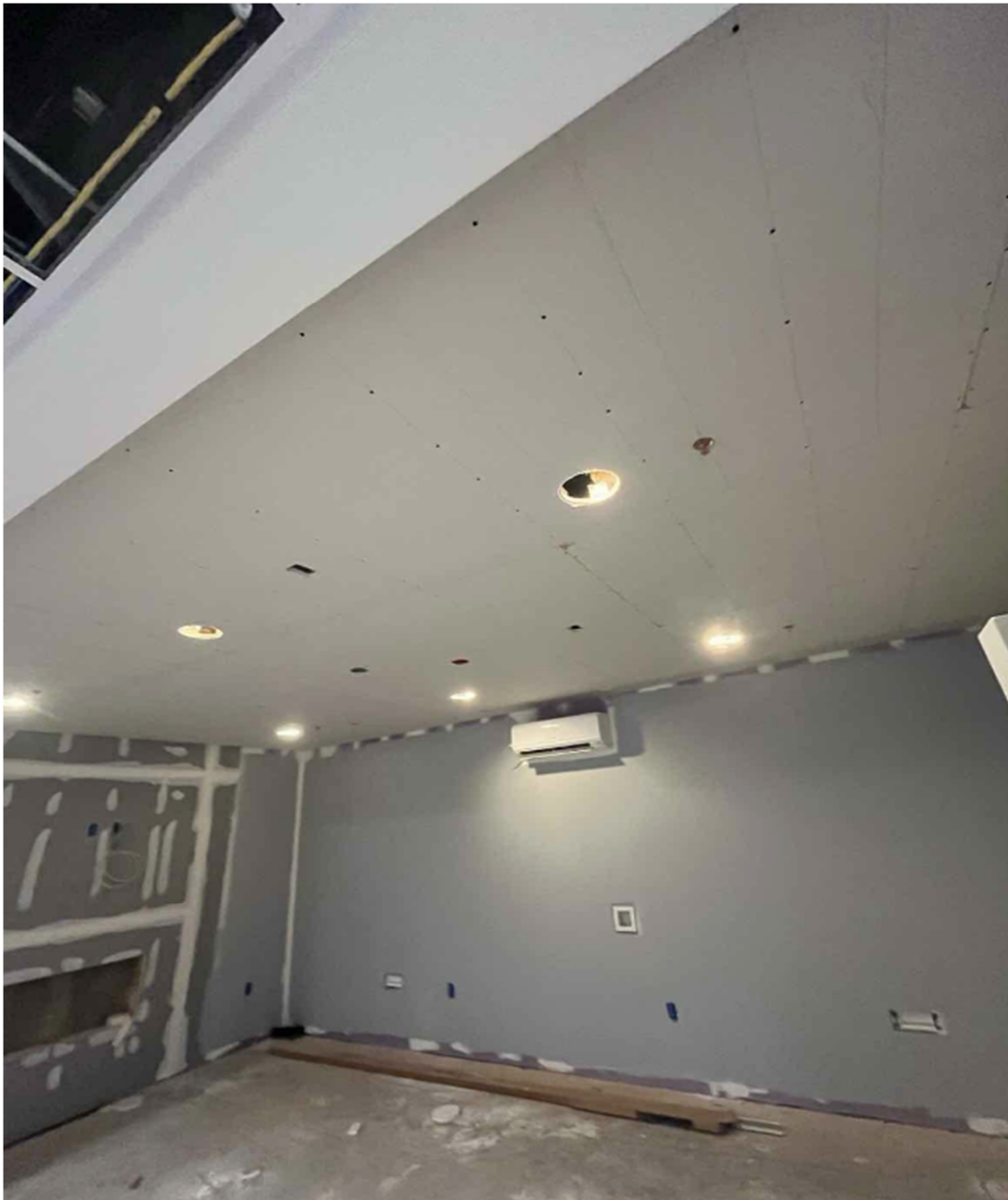
Completed Installation of Insulated Hard Ceilings on First Floor