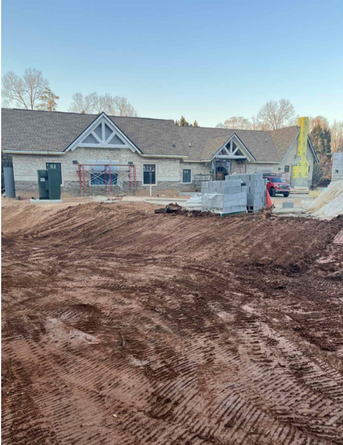
Continued Grading Throughout the Project Site